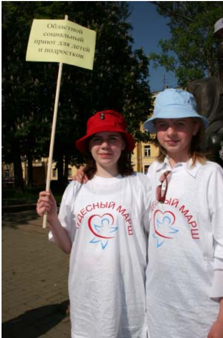
Young Russian students participate in a march to raise awareness about social problems in orphanages through USAID/Russia's Community Support for Orphans Project.