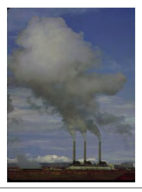
40,000 metric tons of carbon dioxide will not be emitted due to these investments. (The average American creates about 10 tons/year through their home, car and travel.) (source: carbonfund.org)

One significant and quantifiable nonenergy benefit of these efficiency investments is their positive impact upon global warming. The reduced carbon dioxide emissions resulting from these investments is estimated to be over 40 thousand metric tons over the lifetime of the devices installed and education provided.