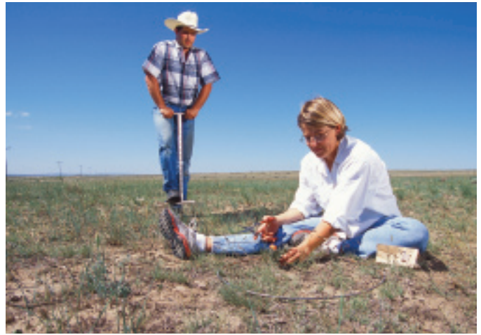
Soil samples and vegetation reflect changes. Measurements before and after burns can document changes to soil nutrients, plant productivity, and other parameters.

On the other hand, chaparral is a fire-adapted shrubland that sometimes has extremely high surface temperatures of 700°C. Although the vegetation may be totally consumed, the impacts on soil N are mixed, with most fires showing increases or no change in mineral N (decreases occur primarily through erosion), and others showing decreases or no change in total N (Table 3, Neary et al. 1999, DeBano et al. 1998). Consumption of the vegetation means that a large fraction of total ecosystem N has been lost, but studies have shown the capacity of chaparral to recover its N capital during succession. Available N in fact declined during 80 years of succession following fire in chaparral, indicating the role of fire to release immobilized N and stimulate plant growth (Fenn et al. 1993). In addition, the early years of succession in chaparral are characterized by high colonization of the N-fixing leguminous shrub Lotus scoparius , which declines after only 5-7 years. Other sites have persistent