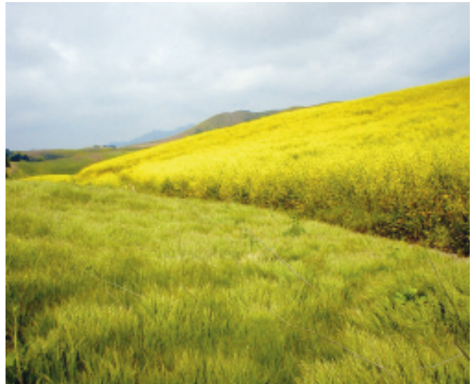
Burns may clear one weed and stimulate another. A burn was conducted to control ripgut brome ( Bromus diandrus ), which remains dominant in the unburned foreground. Beyond the firebreak, a nonnative forb, black mustard ( Brassica nigra ), has taken over after the grassland burned.

Most often a single method is not effective in the sustainable control of a range weed. A successful long-term management program should be designed to include combinations of mechanical, cultural, biological, and chemical control techniques (DiTomaso 2000). Integrated approaches for weed management have not been well studied. This is true with or without the incorporation of prescribed burning. Innovative land managers have successfully used integrated strategies to control many different species. However, these reports occur mostly as anecdotal stories and do not appear in the literature. A greater exchange of information is needed in all areas related to the use of integrated weed management in rangelands and wildlands.