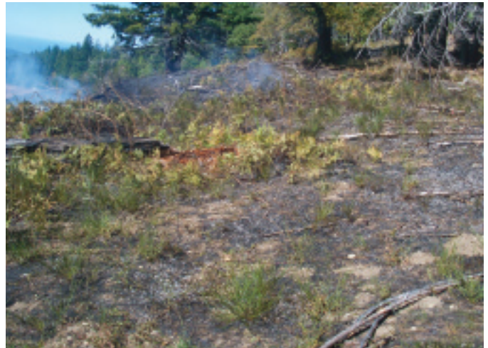
Fuel loads, site and weather conditions affect burns. This patchy burn in the Bald Hills of Redwood National and State Parks in California reduced cover of Scotch broom and stimulated the soil seed bank, but left significant areas unburned.

Probably the biggest gap in our understanding of the ecosystem effects of prescribed burning is the impact it has on native vegetation. Only a few perennial grasses and legumes species have been studied in any detail. There is much to know on the effects of burning on other native and non-native species, both short and long-term responses to single fire events or repeated burning. It is particularly important to understand the impact of burning on threatened and endangered plant species. Understanding their response to fire can assist in the decision making process on managing invasive species.