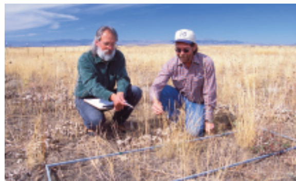
Post-burn monitoring documents changes to plant community. US Department of Agriculture rangeland scientists measure regrowth after a burn.