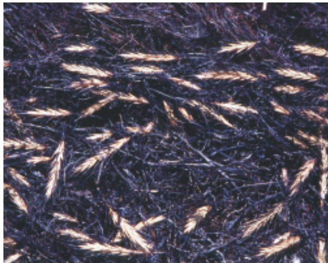
Timing is key to controlling plants and seeds. Though they appear intact, these medusahead seedheads from the canopy have been killed by the heat of a prescribed burn. This study by UC Davis found that burning before seed dehiscence is one of the most effective controls for medusahead in California's Central Valley region. Bobcat Ranch, Yolo County, California, June, 2003.

Herbaceous perennial grasses and forbs survive for more than two years. They are more difficult to control with fire than invasive annuals. This is particularly true for perennial forbs, for which there are few examples where fire alone has proven suc-