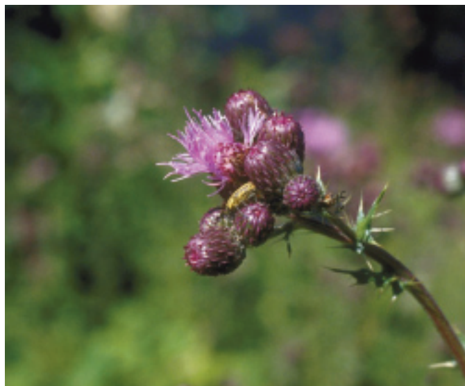
Fire can enhance effectiveness of insect biocontrol agents. Larinus planus (Fabricius), the Canada thistle bud weevil, is shown on Canada thistle ( Cirsium arvense ).

Disturbance regimes affect ecosystem properties such as rates of soil erosion and formation, and