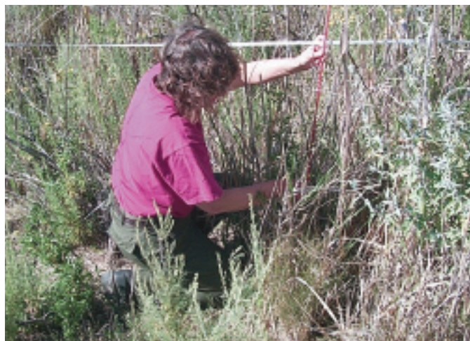
Post-burn monitoring establishes each fire’s impact. By recording species and other vegetation characteristics in burn plots, long-term trends can be established, allowing resource managers to determine whether or not prescribed fire objectives are being met. At Point Reyes National Seashore, vegetation data is collected pre-burn, and at one, two, five, and ten years after the fire.

The effect of fire on individual plants depends on the degree to which perennating (surviving) tissues are protected from lethal temperatures (Whelan 1995). Raunkiaer (1934) developed a life form classification system that groups plants into categories based on the exposure of the perennating tissue to stressful growing conditions caused by summer drought or winter cold. This system is roughly based on the vertical positioning of the perennating tissue above or below the soil surface, which generally corresponds to areas of relatively high and low temperatures during fires (e.g. Brooks