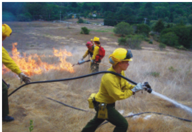
Containment strategies are implemented before a burn. Control lines around the edge of the burn unit can be set by wet-lining with water and foam.

The cost of training, especially for classes outside of the employee’s organization, can be high. Training for a desired function often requires prerequisite training and experience. Often knowledge and ex-