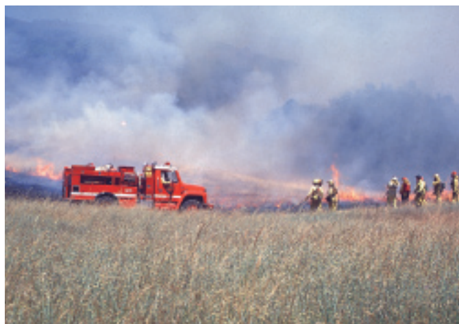
Agencies coordinate leadership responsibilities for prescribed burns. On this burn to control yellow starthistle at Sugarloaf Ridge State Park, personnel from State Parks and the California Department of Forestry and Fire Protection coordinated team activities including preparation of fire lines, equipment crews, and burners and beaters. Sonoma County, California, early July, 1995.

The third responsibility is the designation of a qualified fire manager to execute the project. The duties of the prescribed fire manager include ensuring that resources are available, determining that fuel and weather conditions are within the parameters of the burn prescription, informing regulatory agencies and media of the burn, managing the activity and