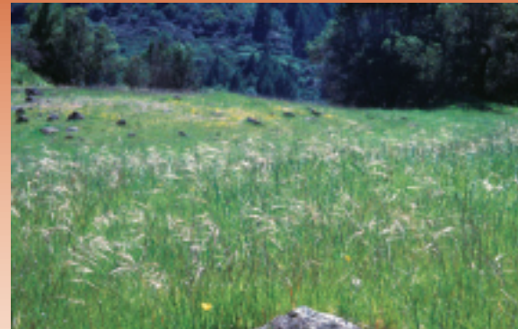
Purple needlegrass ( Nassella pulchra ) and other native plants increased greatly in abundance following consecutive prescribed burns for control of yellow starthistle at Sugarloaf Ridge State Park, Sonoma County, CA.

Much of what we currently know about using fire to manage vegetation—and to control invasive plant species in particular—has been derived from studies of cropland systems. However, there are many fundamental differences between cropland and wildland settings, and our ability to use effects observed in croplands to predict effects that may occur in wildlands is limited. Some of these fundamental differences include the timing of fires, fuel