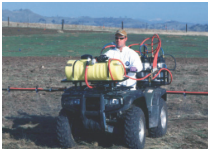
Prescribed burns can enhance effectiveness of herbicides. Pre-emergent herbicides can be more effectively applied to soil when thatch has been burned. Here an ATV-mounted boom sprayer applies imazapic following a summer burn for control of medusahead ( Taeniatherum caput-medusae ). The burn not only prevented new seed recruitment, but it cleared the ground for chemical treatment. Flemming Ranch, Fresno County, CA.

Similar results have occurred with the stimulation of native legumes and perennial grasses in burns