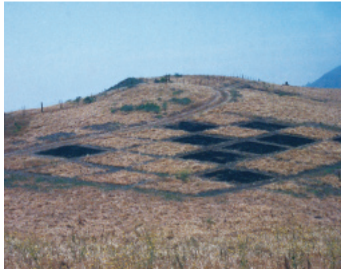
Experimental studies examine ecological effects of fire. On Santa Cruz Island, CA, The Nature Conservancy used patchwork blocks to test how site topography and orientation, as well as burn frequency and seasonality, affect resulting plant community composition and structure. Data was collected before burning and for four years after burning. Results were complex, but in all cases non-native grasses regained dominance when burning stopped.

Many studies describing the effects of fire on vegetation have been conducted after fires have occurred (i.e. post-hoc studies), where there was little or no information on the characteristics of the fire being studied. In many other cases where fire is applied as part of an experiment, the characteristics of fire are described in general terms, or summary values are presented describing the average characteristics of variables such as rate of spread, flame