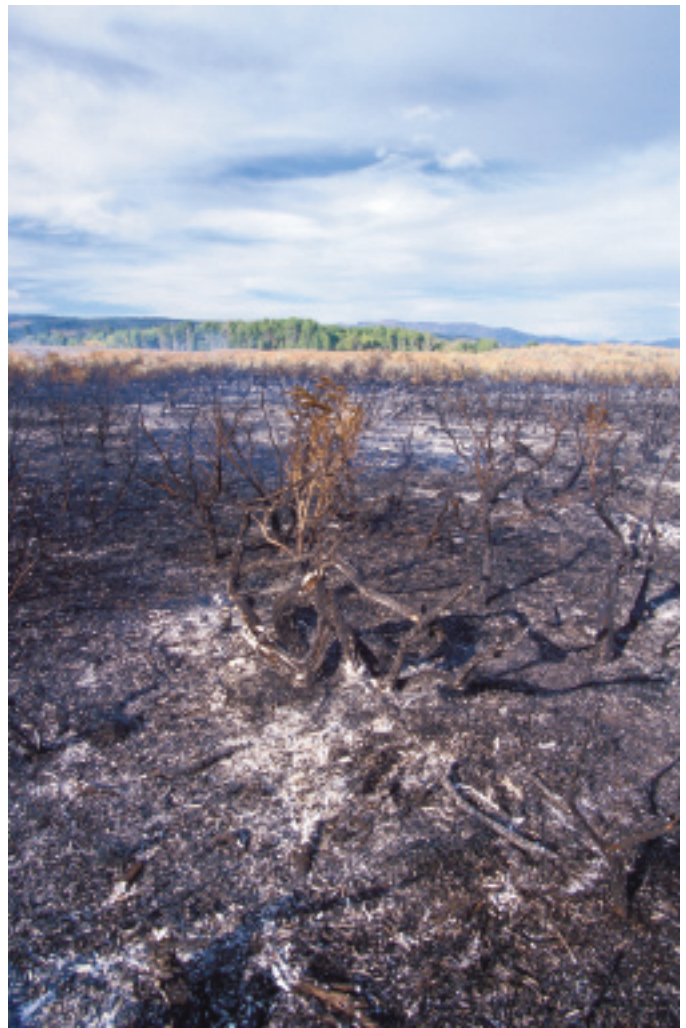
Fire affects all components of soil. Chemical, biological and physical properties are all altered from heat and oxidation of fuels. Henninger Ranch, U.S. Sheep Experiment Station, Kilgore, ID.

In contrast to N, both potassium (K) and phosphorus (P) require >700 °C for volatilization and their loss is usually minimal unless the fire is followed by erosion. Other nutrients such as calcium (Ca), magnesium (Mg), and sodium (Na) require much higher temperatures for volatilization. These other nutrients showed either increases or decreases depending upon the type of ion (Tables 3, 4).