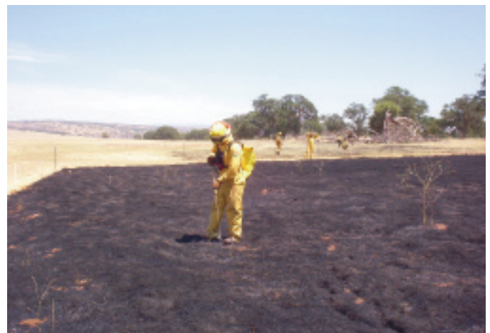
Mop-up activities take place after a burn. Care is taken to make sure hot spots of smoldering fuel won't flare up.

Many agencies can be involved in the review of a proposed project. These typically include the US Fish and Wildlife Service, US Environmental Protection Agency, state Fish and Game agencies, Water Quality Control Boards, Air Quality Management Districts, advocates for threatened and endangered species, archaeological and historical organizations, Native American cultural groups, and various proponents and opponents of prescribed