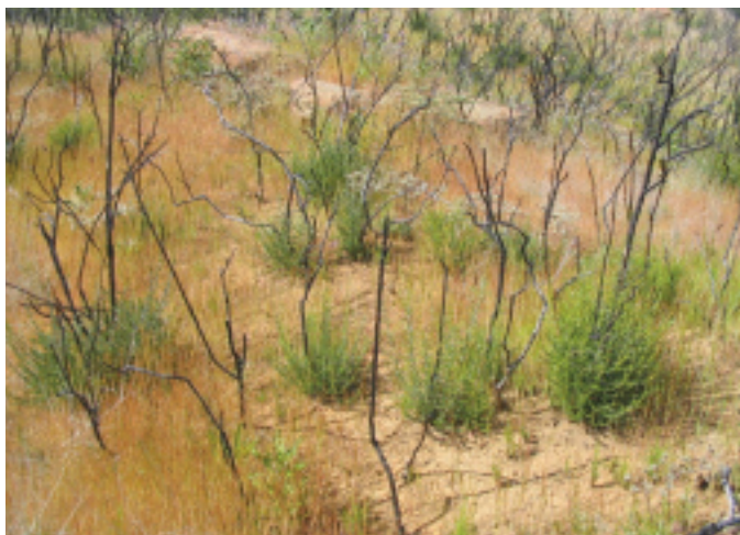
Some species resprout after fire. Fire-adapted woody species, like the native chaparral shrub chamise ( Adenostoma fasciculatum ), can resprout from the base following a burn. Invasive woody species like broom can also resprout. McLaughlin Reserve in the northern Coast Range of California, Spring, 2005.

In eastern and mid-Atlantic states, prescribed burning for woody invasive plant control is conducted during the dormant season, but it is generally unsuccessful because of profuse resprouting from the rootstocks. It is likely that growing season burns would be more effective since non-structural carbohydrate reserves are lowest at this time (Richburg et al. 2001, Richburg and Patterson 2003). This would potentially deplete the energy reserves of the plants root system, making it more susceptible to subsequent burns or other control options.