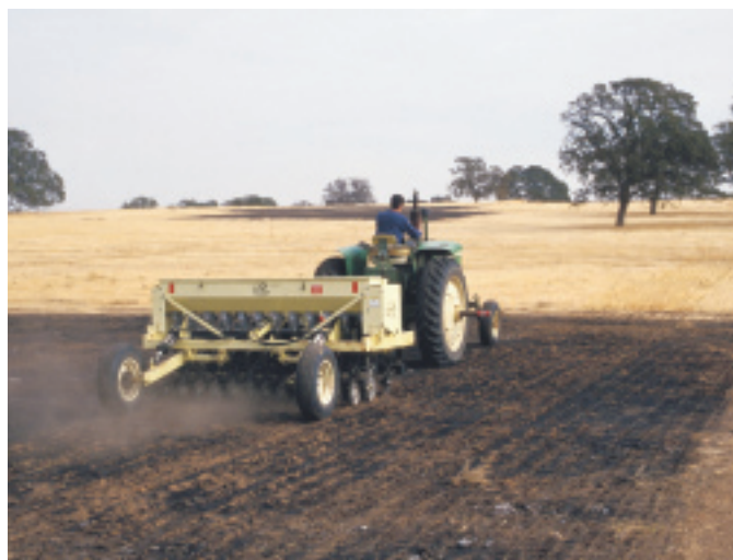
Post-burn seeding can play a role. As part of an integrated management study for control of medusahead, researchers follow a burn with a rangeland drill seeder to plant native cover. Bobcat Ranch, Yolo County, California, Fall, 2003.

In many areas, prescribed burning is not permitted at all, despite its effectiveness in controlling a particular invasive species in that site. However, these sites can experience periodic wildfires. Such a wildfire can be very beneficial to the management of that species, particularly if the timing of the fire is ideal for suppression of the invasive plant. In addition, the scale of these fires is generally larger than