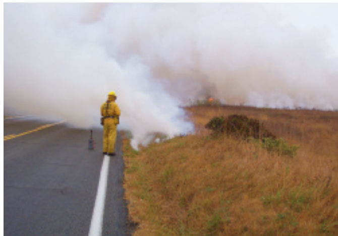
Air quality and road closures are major public concerns. Smoke does not disperse well when a high-pressure system keeps hot air at the surface. This burn at Point Reyes National Seashore was shut down because stable atmospheric conditions did not change.

To overcome these obstacles and proceed with the project, the lead agency must provide as much information and education as possible for the cooperators, neighbors and community. This is best achieved by encouraging participation in the planning process and accepting comments from interested individuals. Concerns need to be addressed and, as necessary, mitigated. Urban dwellers generally have less inclination to support projects involving burning, mostly due to the potential impacts of smoke and property damage. People in rural areas, especially those allied