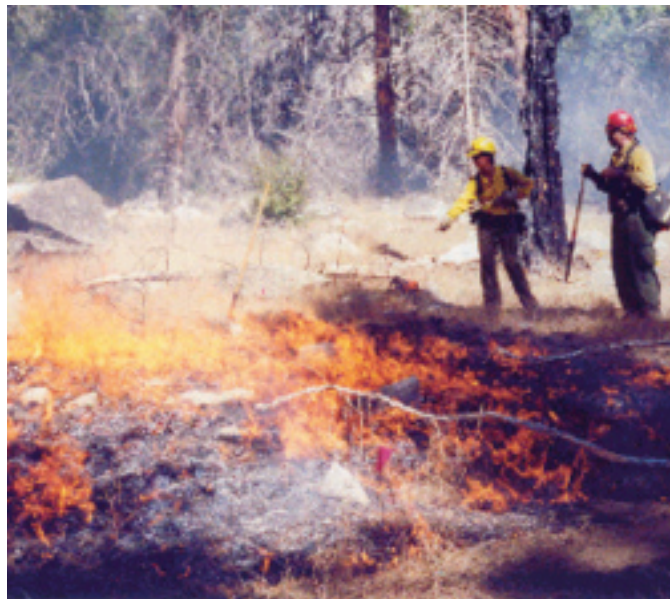
Prescribed burns can be counterproductive. The National Park Service temporarily suspended prescribed burns in lower elevation yellow pine forests of the southern Sierra Nevada because the burn prescription being used aided invasion by cheatgrass ( Bromus tectorum).