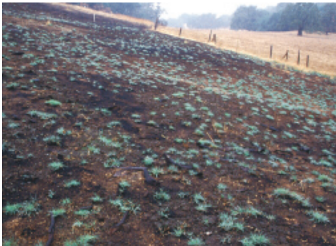
Native plant communities can regenerate after fire. Meadow barley ( Hordeum brachyantherum ) resprouting in early Spring, 1998 following a prescribed burn the summer before to control barb goatgrass. Two years of burning was found to provide good control of barb goatgrass. Hopland Research and Extension Center, Mendocino County, California.

A clear distinction must also be made regarding the effects of a single fire versus the effects of a repeated pattern of burning over time, otherwise called a fire regime. Single fires can display significant temporal and spatial variability, as described. This variability is compounded in fire regimes involving multiple fires over time. Fire regimes can vary in the type, frequency, intensity, extent and spatial pattern,