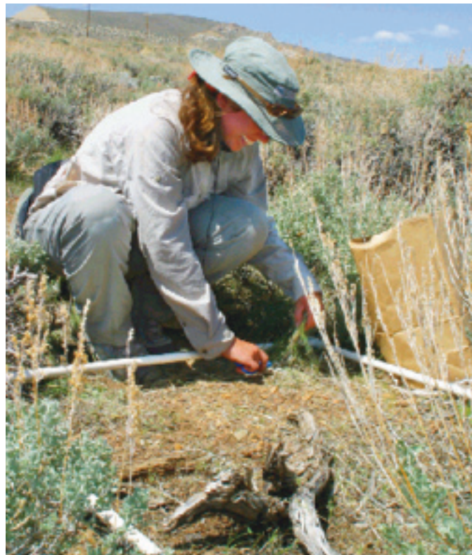
Fuels impact fire characteristics. Before test burns, US Geological Survey staff collect biomass to assess fuel loads and fuel moisture. Mono Lake, CA.

Late spring or early summer burning has been shown to have a more pronounced positive effect on forb species, both native and non-native (DiTomaso et al. 1999). Three consecutive years of prescribed burning increased native forb cover in spring by nearly 400% in Sonoma County, boosting the native proportion of total forbs from 17% live canopy to 67% (DiTomaso et al. 1999). A number of individual