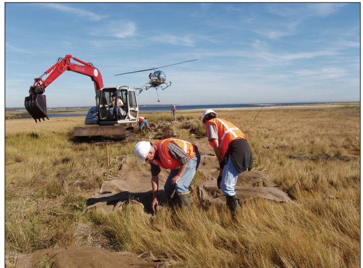
New Bedford Harbor Superfund Site - see case highlights.