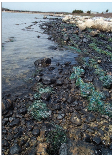
Buzzards Bay/Bouchard Oil Spill - see case highlights.