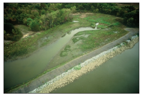
DuPont Newport Superfund Site - see case highlights.