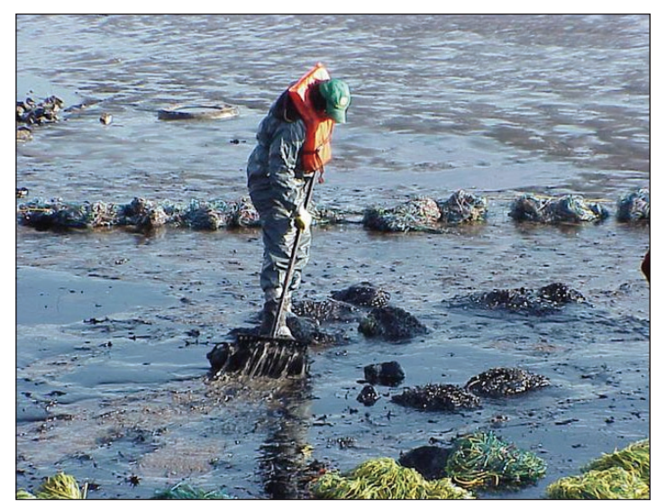
M/T Athos I Oil Spill, DE, PA, NJ - see case highlights.