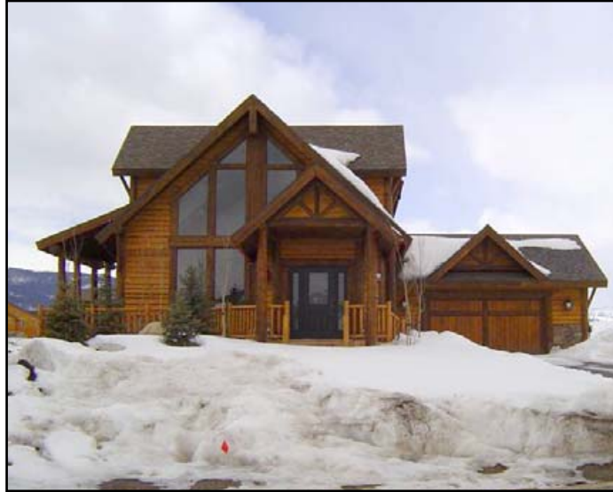
Modern day modular homes are a far cry from what many of us remember rolling down the road in the past. This custom home was installed in one of Colorado's mountain resort communities, and one would be hard pressed to distinguish it from neighboring homes built with more traditional methods.