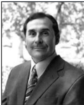
Bill Ritter, Jr.