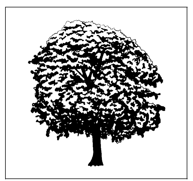
Figure 1. Middle-aged Mango.

Height: 30 to 45 feet Spread: 30 to 40 feet Crown uniformity: symmetrical canopy with a regular (or smooth) outline, and individuals have more