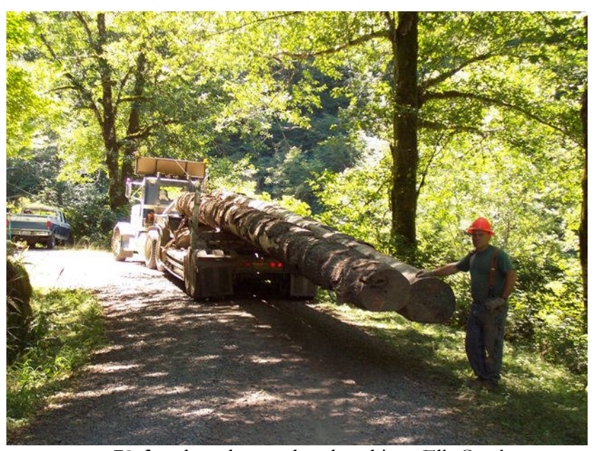
70-foot long logs to be placed into Elk Creek.