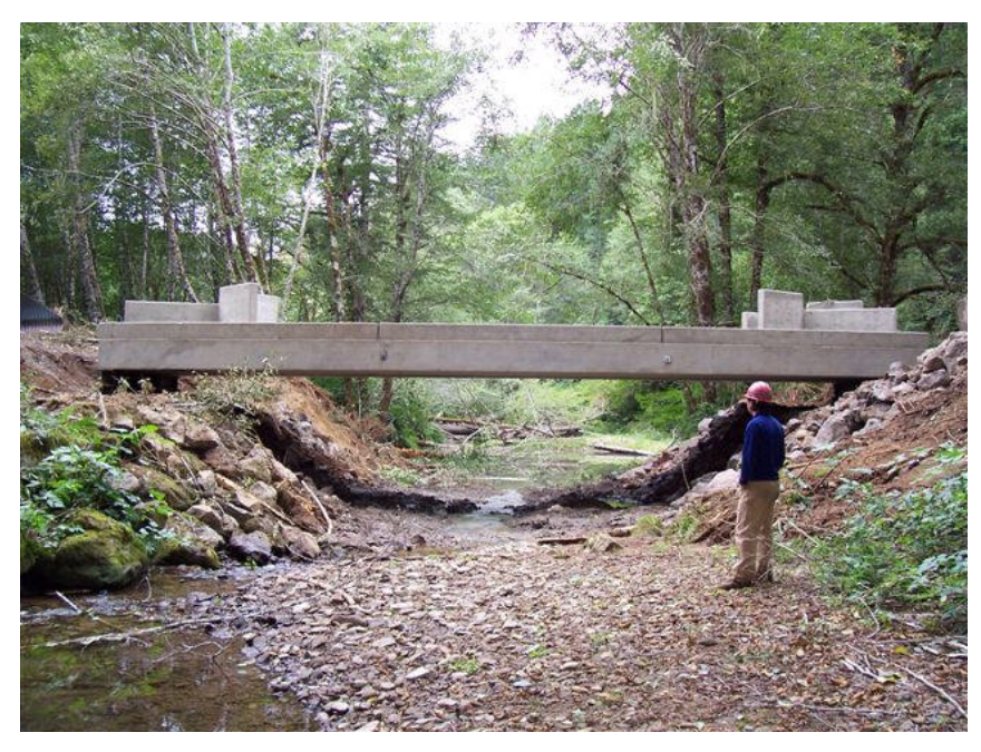
Concrete stringer bridge under construction on the West Fork Millicoma River that opened up four miles of habitat to juvenile fish migration.