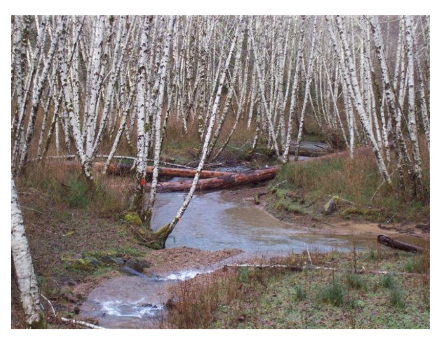
Log structures placed in Elk Creek during the summer of 2006.