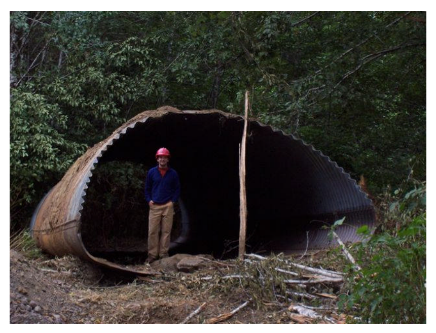
Pipe-arch removed from the West Fork Millicoma River to allow juvenile fish passage upstream and downstream.