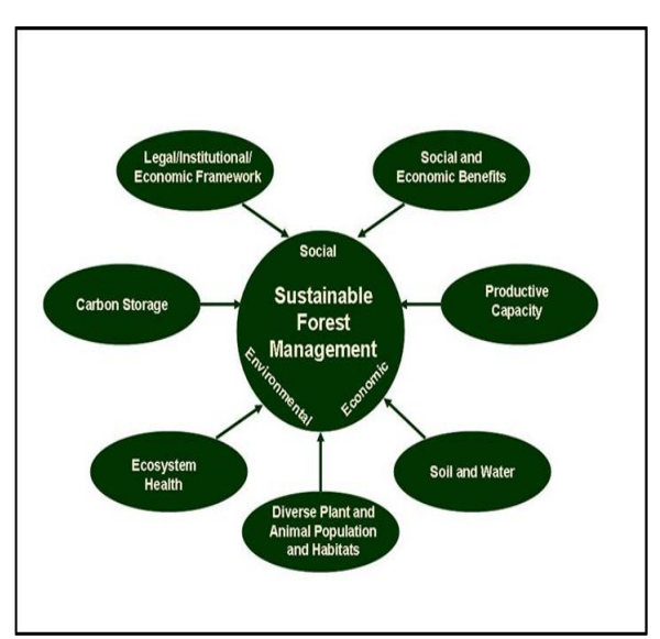
The Seven Sustainable Forest Management Strategies in the Forestry Program for Oregon

strategies in the 2003 Forestry Program for Oregon. These can now be used to begin to measure progress towards sustainably managed forests. This work can inform the Board, other policy-makers, and the public about the environmental, economic, and social conditions of Oregon's public and private forests, and can provide a cost-effective way to collect data needed to monitor changes in these conditions. They can also convey critical information more simply to build public confidence, and facilitate better communication and cooperation