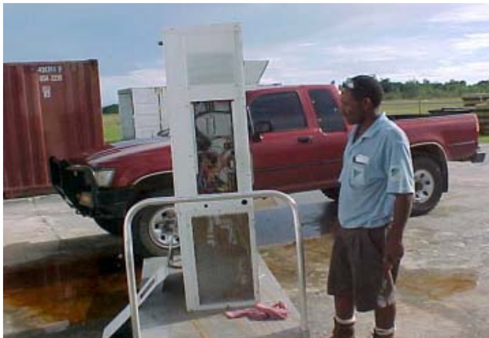
Figure 8. Manus Island electrical contractor attends to a faulty air conditioning unit.