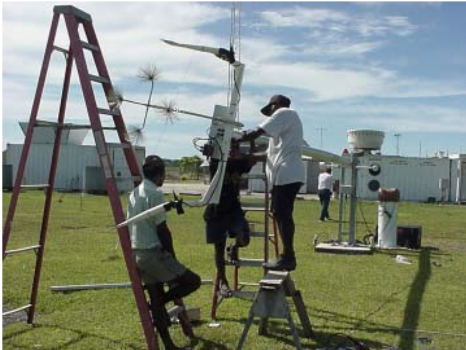
Figure 1. Papua New Guinea NWS Staff assist the Australian Bureau of Meteorology (BOM) maintenance team with surface meteorological instrumentation maintenance.

All three TWP Atmospheric Radiation and Cloud Stations (ARCS) are operated by indigenous staff. In Papua New Guinea (PNG), ARCS operations are performed by PNG National Weather Service (NWS) staff and in Nauru by contracted staff under the administration of the Nauru Department of Economic Development (DED). Contracts between Los Alamos National Laboratory (LANL) and the host countries sanction the operation of the stations and the day-to-day operation of ARM ARCS equipment. The support provided to the host countries through the contracts also provides additional benefits (e.g., by providing staff training and technical support, the ARM Program provides indirect assistance and opportunities for NWS development [see Figure 1.]