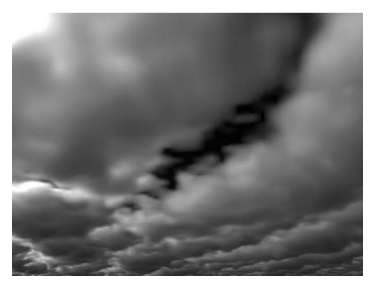
Figure 3. A surface based camera image simulated by SHDOM looking up at an LES stratocumulus field.