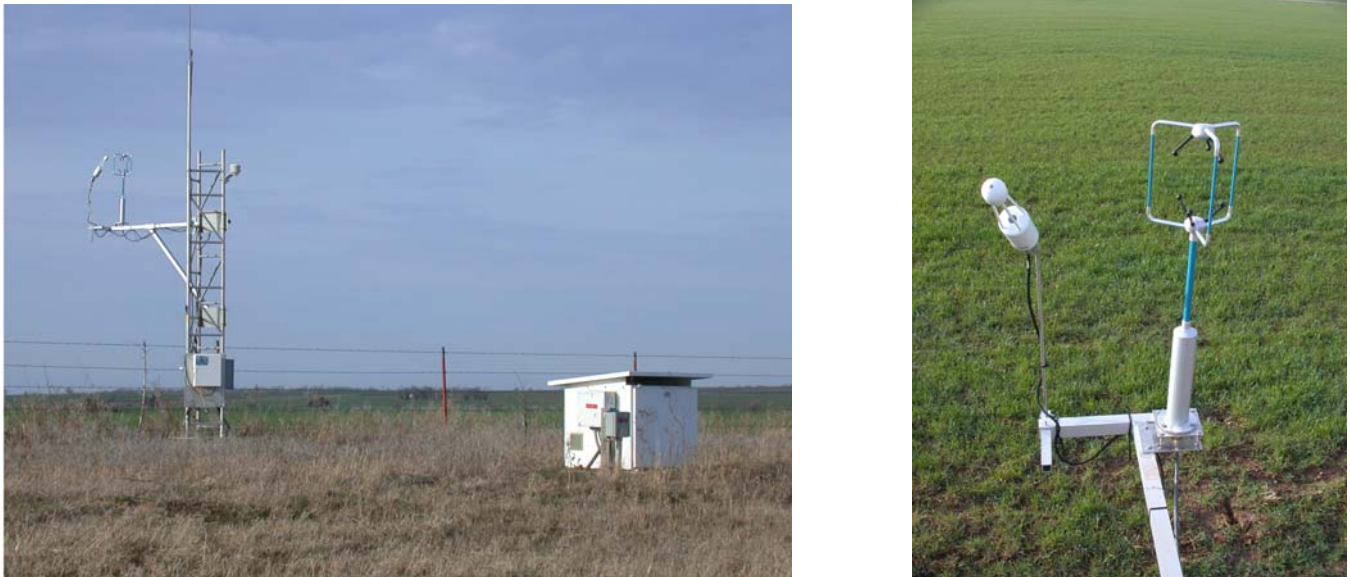
Figure 1. (a) The ECOR system at the Central Facility; (b) sonic (right) and IRGA (left) sensor heads installed on the boom.

The system has storage capacity on the local hard drive for several months of data; currently the backup data holding time is limited to 60 days, and all older data are automatically deleted. This setup provides a time window long enough to verify that the data were ingested successfully and reached the ARM archive.