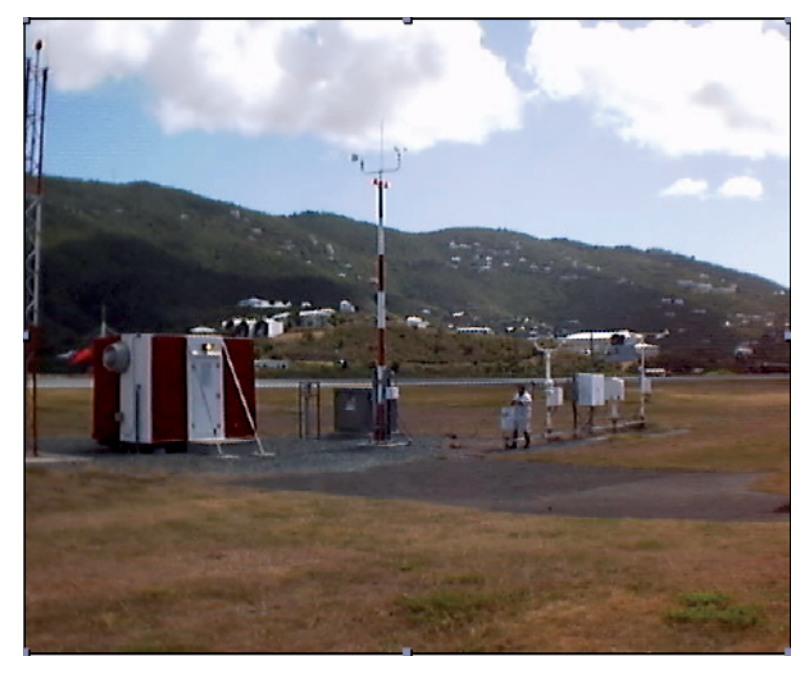
FIG. 4. Assessing roughness is not valid in locations where upstream fetches are influenced by complex terrain, for example, northward-looking fetch from the St. Thomas, U.S. Virgin Islands ASOS (KSTT).

tions (33.0 m s<sup>-1</sup>) might be experienced nearby in locations with open exposure, we used (1) and (2) to estimate what the instruments might measure in their actual exposures. The effect of the rougher exposures is to underestimate the unobstructed flow conditions by 30%–40%, hence it is important to correct poorly exposed measurements. It is important to note that the roughness assessments and correction methods described herein are not valid for upstream fetches influenced by complex terrain (Fig. 4), where the measurements are affected by local flow accelerations associated with hills and valleys (Miller and Davenport 1998; Powell and Houston 1998).