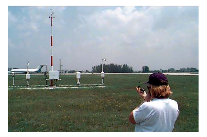
Fig. I. Documentation of Opa Locka Airport (near Miami).

At the time of writing, 211 ASOS stations and 30 C-MAN stations have been photographically documented (Fig. 2). In addition to providing information on wind exposure, the photos allow NCDC to document types of temperature and precipitation sensors at each station. Operational forecasters may also benefit from the wind exposure documentation as it is sometimes difficult for forecasters to be familiar with the surroundings of ASOS and C-MAN stations they work with and validate against, within their county warning areas. The ASOS exposure documentation photos and other information could be linked to the local NWS Forecast Office Web page. If a forecaster sees