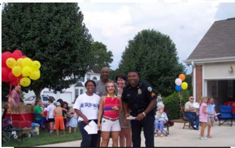
Molly's Meadow Neighborhood Watch

Neighborhood Watch, Manches- neighborhoods are organized and Inc. have partnered with the 28th ter Park and Kesington Forrest Neighborhood Associations cently held "National Night Out" events in their neighborhoods. National Night Out is a unique crime / drug prevention event sponsored by the National Association of Town Watch designed to heighten crime and drug prevention awareness, generate support and participation for local anticrime programming, strengthen fighting back. neighborhood spirit and partner-