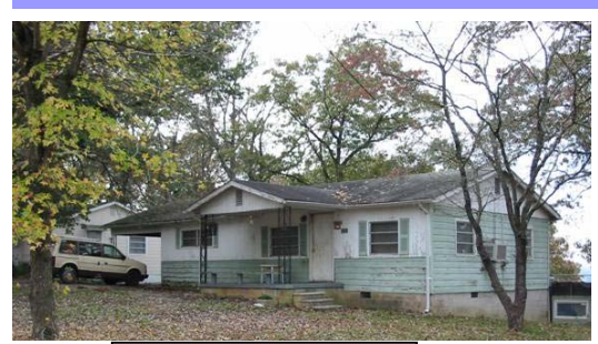
Before: 7647 Austin Drive

This property located at 7647 Austin Drive is another example property owners working with the City's Department