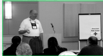
ARC speaker at NSD conference