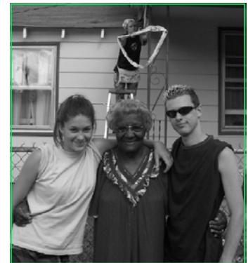
Youth volunteers participate in construction projects...