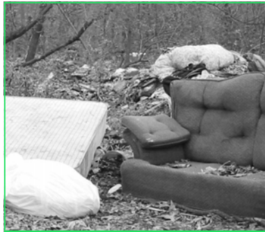
Illegal dump site in the city

community revitalization buy into the “broken window theory.” That is, in a neighborhood where all is in pretty good shape, a broken and un-repaired window will draw the at-