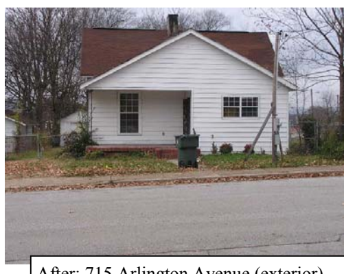
After: 715 Arlington Avenue (exterior)

Property owners made the necessary repairs to bring the property into compliance with the Code, greatly improving safety and aesthetic appeal of the structure.