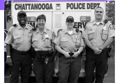
The Animal Services Team: reducing animal overpopulation!