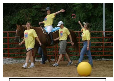
Equestrian exhibition from 2005 Go! Fest

abled and ready to sell their beau- all abilities. If you haven't had a enjoy a beautiful fall afternoon about Go! Fest, log onto Last year's event was such <u>WWW.Gofest.info</u> or call 756-2211. I'll see you there!