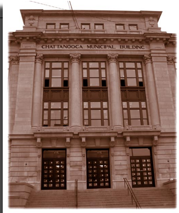
The Chattanooga Municipal Building, or City Hall, as it stands today.

"It has been my honor and privilege to witness the rebirth of this beautiful historic building. I would like to invite everyone to help us celebrate the Grand Re-Opening of City Hall as a gift to the City of Chattanooga."