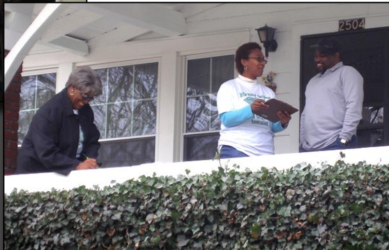
Volunteers went door to door in the neighborhood to sign up new recruits