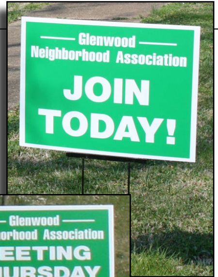
Signs were put out in the community to announce the meeting and encourage new members to come join the association

The GNA wants to thank all who support the efforts to bring about positive changes in Glenwood. With the help of our partnerships with the Department of Neighborhood Services and Community Development and Community Impact of Chattanooga, good things are happening to Glenwood, "A Community Jewel".