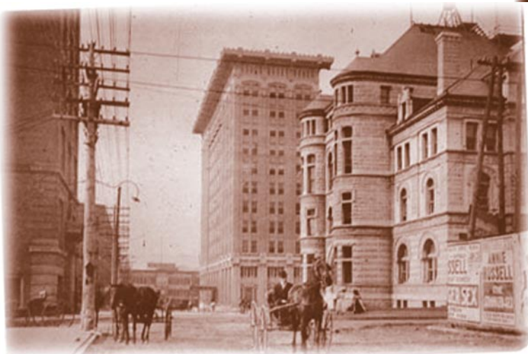
Looking West down 11th Street, 1908. On the right is the construction site for the Municipal Building.