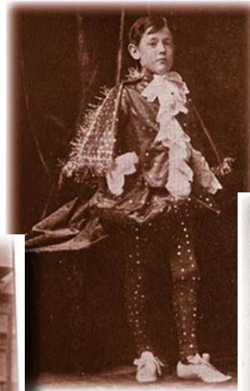
Children dressed for the Spring Festival, 1904. An annual event in the early 1900s, the Spring Festival was celebrated with parades and street parties on Market Street

The remainder of the day the streets around City Hall will be closed for a free celebration in the style of circa 1908. This engaging festival brings in the flavor of that era