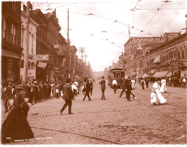
Market Street looking north from 9th Street, 1909. Note the dress of the day!

ribbon cutting ceremony, and city celebration surrounding this special event.