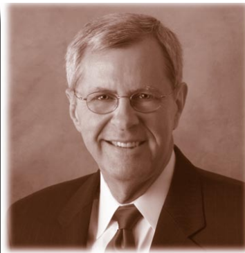
Mayor Ron Littlefield

when Model A's had just been built, Coca-cola was 5 cents a bottle, and women wore big hats, frilly collars, and long dresses. While you are waiting to take a free guided tour of City Hall, visit the turn of the century petting zoo, the Creative Discovery Museum's children's activity area, the Towing and Recovery Museum's old tow truck, tractor and car show, The Chattanooga Regional History Museum's interactive "What is it?" exhibit, the Chattanooga Library's old book exhibit, and see for yourself the treasures recently unsealed in the 100 year old City Hall Time capsule. To capture the moment, free souvenir photos will be taken in front of City Hall. There will be turn of the century music, food, and more fun than you can imagine. Saturday, May 19th is your chance to experience the flavor of 1908 during City