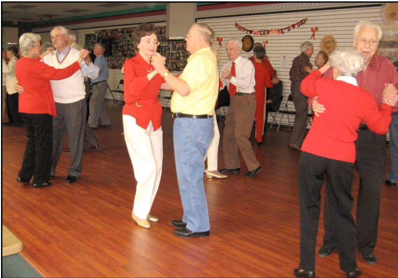
Cutting a rug at the Eastgate Seniors Activity Center Valentine’s Dance