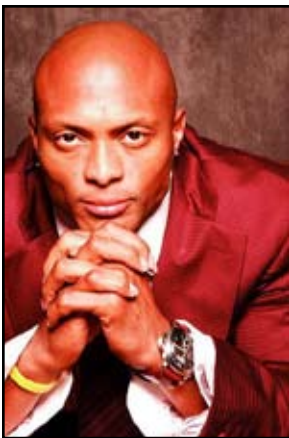
Former Titan Eddie George