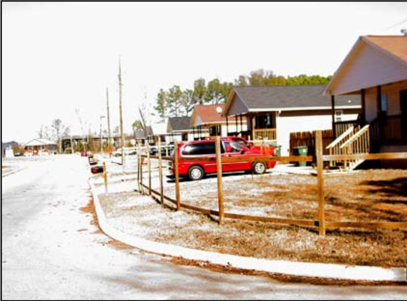
The Shepard Park subdivision benefits from CDBG grants.

Habitat for Humanity recently finished an infrastructure project that was funded by the Department of Neighborhood Services and Community Development. Habitat received a 2005-2006 Community Development Block Grant (CDBG) in the amount of $160,000 to install water and sewer connections to newly constructed homes in the Shepard Park subdivision (near the Chattanooga Metropolitan Airport). A portion of the funds offset road paving costs in the same area. Nine low-income families will benefit from the project by way of lower home purchase prices as well as a zero percent interest rate. Habitat for Humanity of Chattanooga has received several CDBG grants in years past. Habitat's policies forbid them from using federal grants on hard construction costs, so the grants have typically been used for items such as paving, lot acquisition, or utility installation.