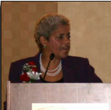
Atlanta Mayor Shirley Franklin