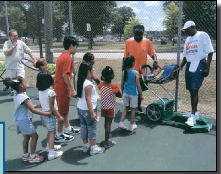
Chattanooga Racqueteers Tennis Association conducting summer tennis camp partially funded by Neighborhood Partners Program

applications will be available August 16th Neighborhood Associations - now is the time to prepare your project ideas for Development • Safety • Beautification