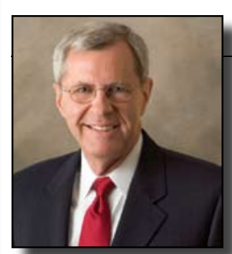
Mayor Ron Littlefield