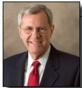
Mayor Ron Littlefield