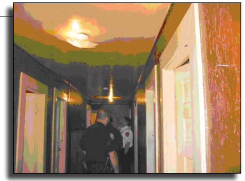
This single family dwelling was illegally converted to a boarding house. Plywood and doors were constructed to divide larger rooms into 10 small rooms large enough for little more than a mattress.

Most often, Neighborhood Services code inspectors will receive a complaint about inoperable vehicles that turns out to be an automobile repair business operating in a residential area. They may have been issued a license to operate that business, but obviously, the neighbors are not happy about it.