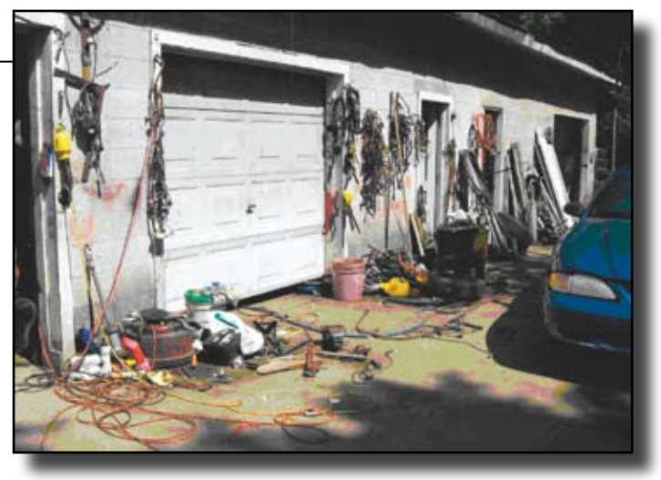
to Public Works Department Land A garage operating illegally in a residental zone

Very often our code inspectors encounter violations that actually fall under zoning ordinances. We receive a nuisance complaint for litter, abandoned vehicles or housing that turns out to be a zoning issue. Many people may not be aware they are in violation of the zoning ordinances, while others simply think they can get away with it. If we answer a complaint that turns out to be an illegal business, the complaint is referred to Public Works Department Land Development Office.