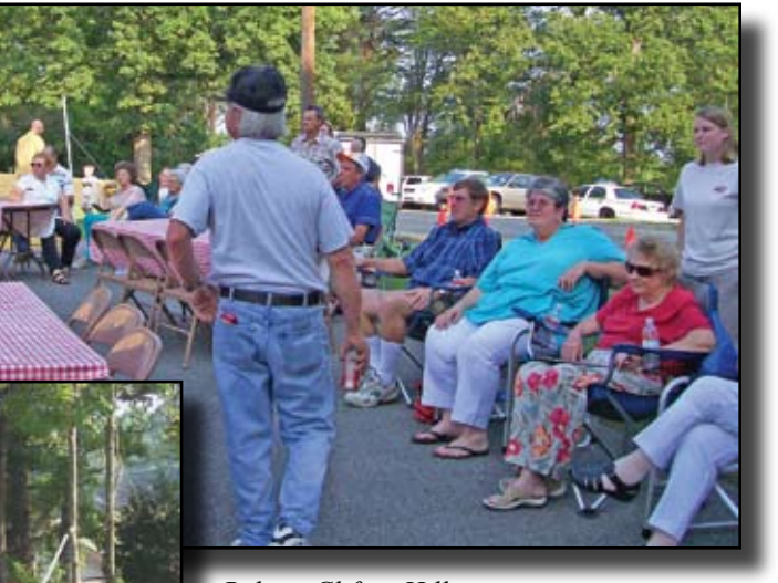
Below: Clifton Hills participants enjoy refreshments at their night out

Chattanooga neighborhoods across the city participated in National Night Out on August 7th. This nationwide event promotes crime and drug prevention awareness, partnerships with community and police, and sends a message to criminals that the neighborhoods are organized and fighting back. The event is coordinated by the Chattanooga Police Crime Prevention Unit with the assistance of their Neighborhood Relations partners in the Department of Neighborhood Services and Community Development.