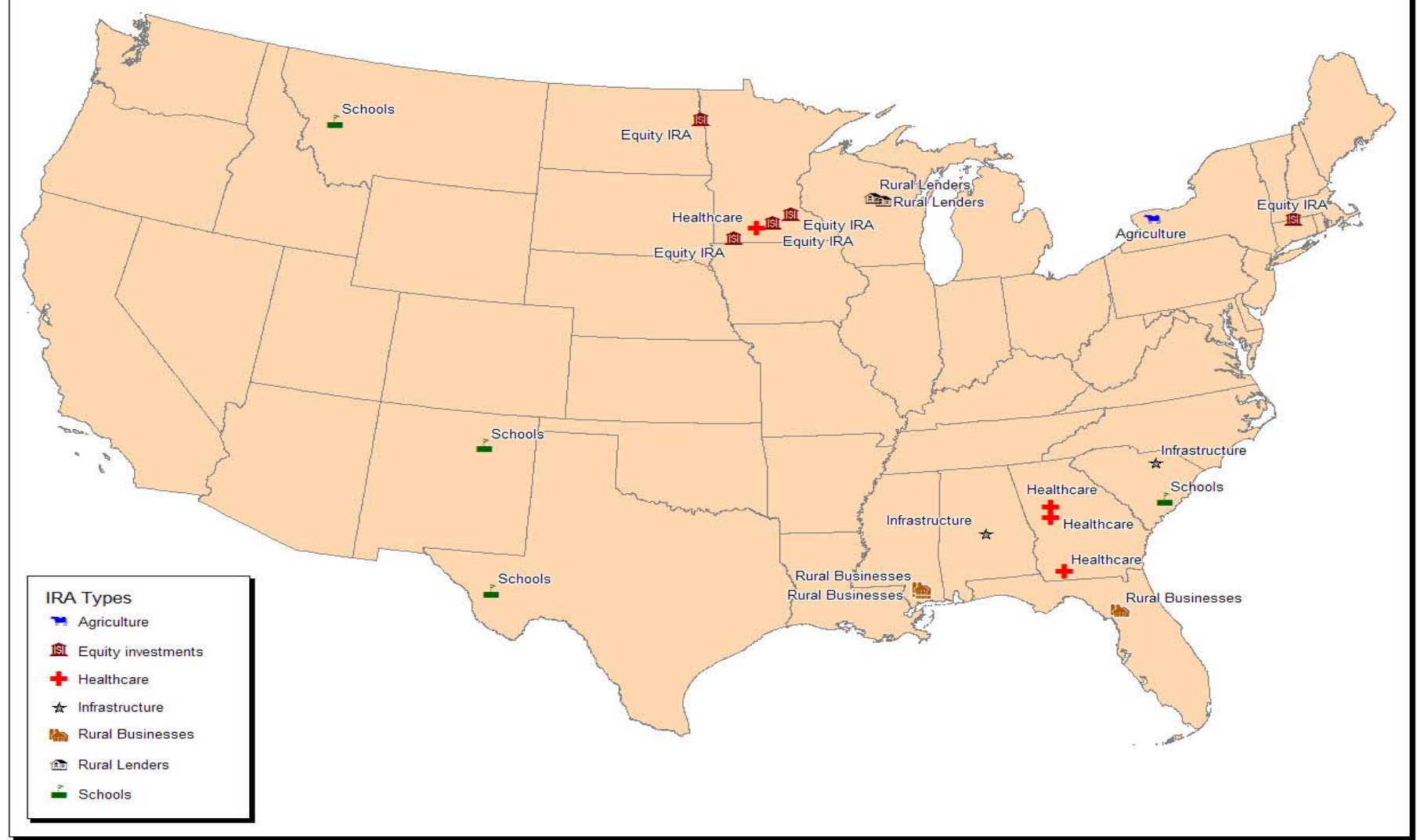
Farm Credit Administration