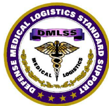
The Defense Medical Logistics Program