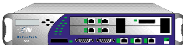
Figure 1: Front of the NetScreen-500 Device