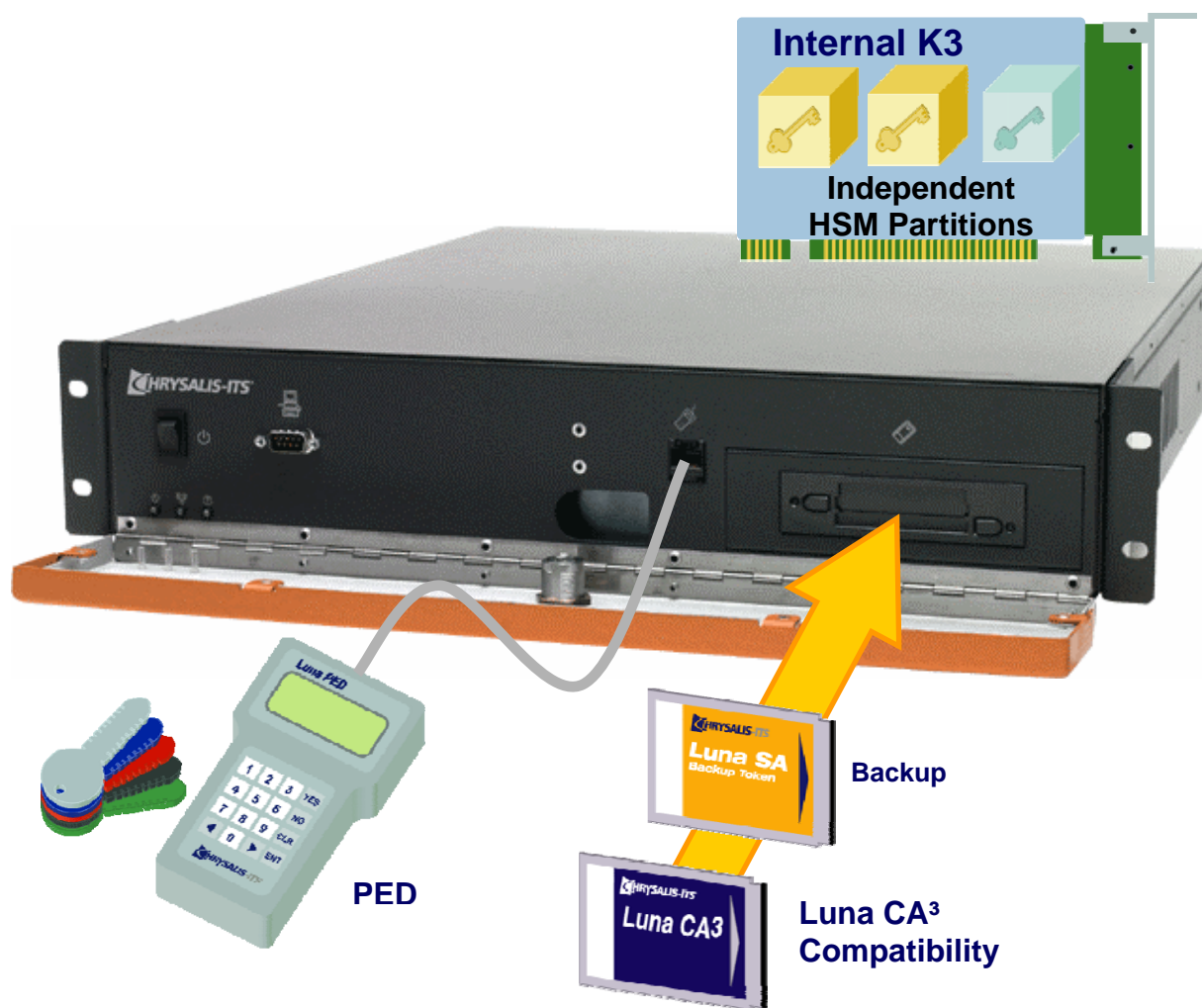
Figure 2-1 Luna® SA HSM Server System

The K3 cryptographic engine is a multi-chip embedded hardware cryptographic module in the form of a PCI card that resides within a customized general-purpose computing appliance. It is contained in its own secure enclosure that provides physical resistance to tampering and zeroization in the event the enclosure is opened. The cryptographic boundary of the module is defined to encompass all components inside the secure enclosure on the PCI card. Figure 2-1 illustrates the use of the K3 cryptographic module and associated peripherals, such as the Luna® PED and the backup token, within the Luna® SA HSM Server system (an example of a host appliance using the K3 cryptographic module). Figure 2-2 shows the K3 cryptographic module as it is installed in the Luna SA HSM Server.