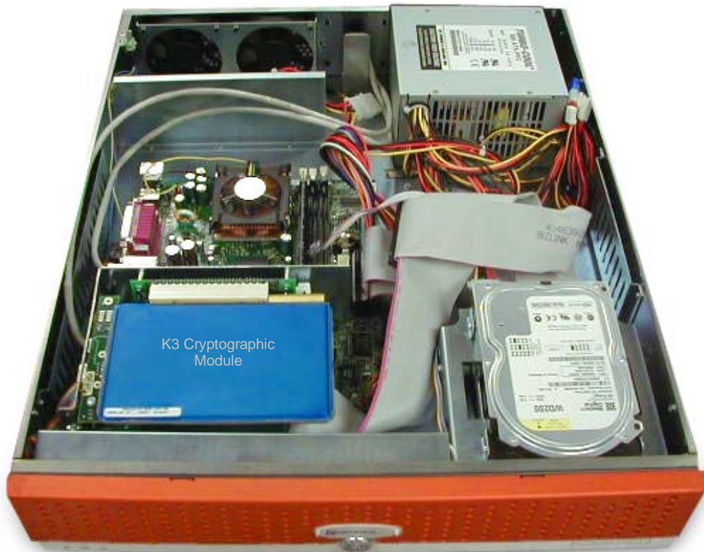
Figure 2-2 K3 Cryptographic Module Inside Luna SA

The module may be explicitly configured to operate in either FIPS Level 2 or FIPS Level 3, or in a non-FIPS mode of operation. Configuration in either FIPS mode enforces the use of FIPS-approved algorithms only. Configuration in FIPS Level 3 mode also enforces the use of trusted path authentication.