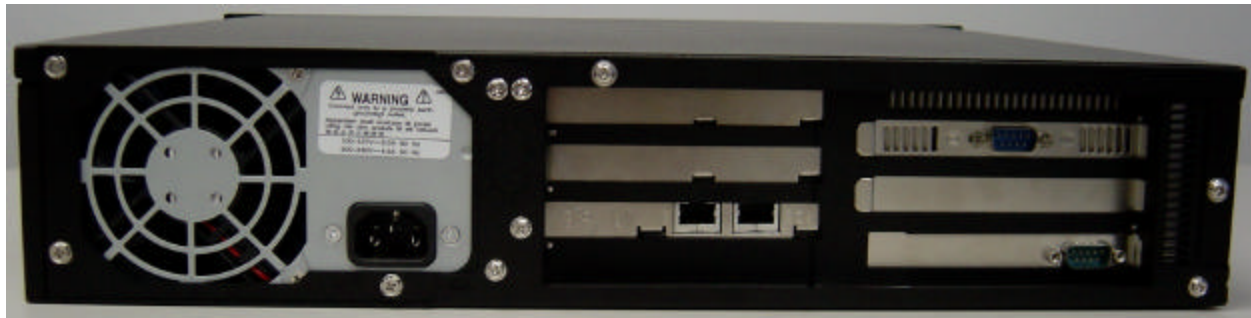
Figure 2 – Rear Physical Ports of the EC200

All of these physical ports are separated into the logical interfaces defined by FIPS 140-2, as described in the following table: