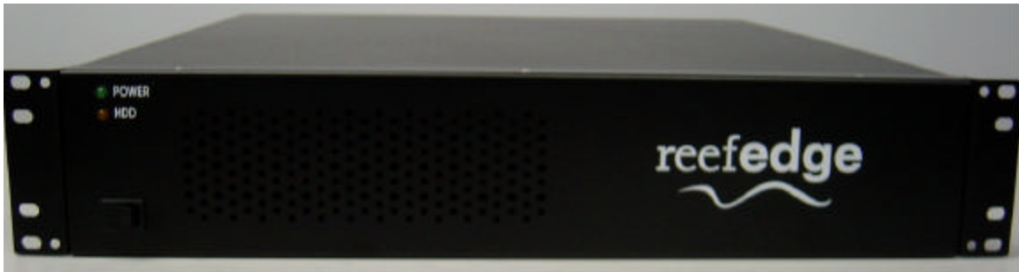
Figure 1 – Front Physical Ports of the EC200

The cryptographic boundary of the EC200 is defined as the metal case enclosing all of the system components. The module is accessible only through well-defined physical ports, including an internal Ethernet port (connected to the LAN), an external Ethernet port (connected to the WLAN), LEDs, a serial port, a power switch, and a power connector. (The module has one additional serial port. This port is not initialized or used in the FIPS-compliant version of the EC200.)