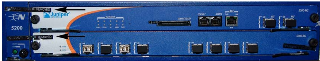
Fig. 2: Tamper Evident Mechanisms, Front of NetScreen-5200