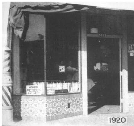
In 1920 a room in the back of this barbershop on Pico Boulevard in Los Angeles served as the first home of the Douglas Company.

The existence of these drawings is basically unknown to the public at this time. The drawings have been unavailable to the public for decades. They are in very poor condition, since they were stored tightly rolled, and the paper suffered acidic damage, leaving them very brittle. Thanks to support from the