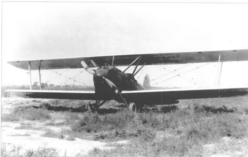
The Cloudster, designed for a nonstop transcontinental flight, was the first Douglas production aircraft.

A 28-year-old Donald Douglas, his wife, and two boys arrived in Los Angeles early in 1920. Douglas had been the first graduate of the aeronautical engineering program at The Massachusetts Institute of Technology. A few years later, as the Martin Company's chief engineer, he had designed a highly successful twin-engine bomber. With the end of the First World War, the aircraft industry hit a severe slump, and with the cutting of government contracts, most of these factories closed their doors. Worse, the Government was selling war surplus aircraft for as little as $300.