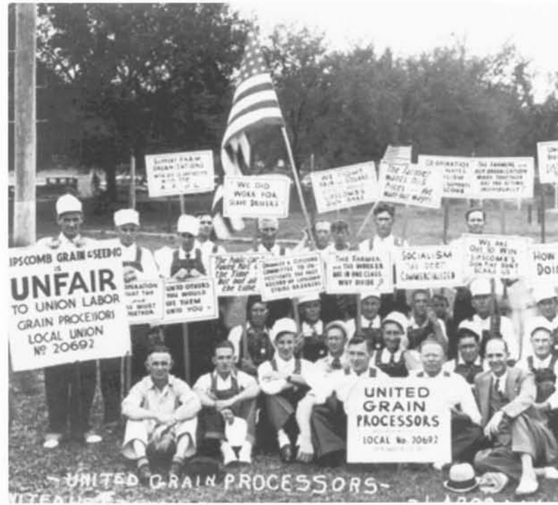
United Grain Processors, Local 20692, of Springfield, Missouri, during the Lipscomb Grain & Seed Co. Strike of 1937.

Records from various locals and from the Springfield Labor Council echo national declines in union membership in the 1960s and 70s. Internal disputes, competitive organizing drives leading to failed elections, and the loss of jobs from automation and overseas production conspired to further depress union