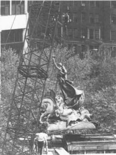
Members of Ironworkers, Local 197, Stone Derrickmen and Riggers hoist the 17-ton statue, Columbia Triumphant, to its base at Columbus Circle in Central Park, New York City, in 1980.