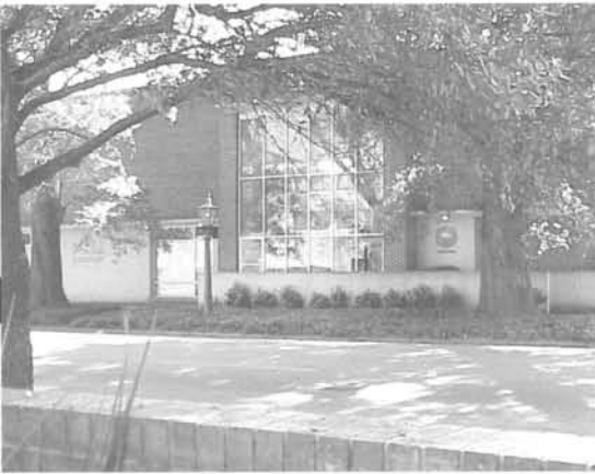
Mobile Municipal Archives Building, Mobile Alabama.

Common Council form was reinstated, and the City Charter of Mobile was re-established. In 1911 the city changed to a Commission form of government which was, in 1985, changed by a court order to a Mayor-Council form.