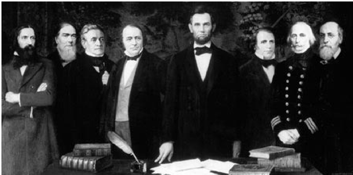
President Abraham Lincoln signs the charter of the National Academy of Sciences in 1863. Joseph Henry, depicted third from the left in this 1924 painting by Albert Herter, and the most famous American scientist of the 19th century, was instrumental in the Academy's establishment. An article on the Joseph Henry Papers project begins on page 11.

Visit us on the Web at < http://www.nara.gov/nara/nhprc/ > or e-mail us at < nhprc@arch1.nara.gov >