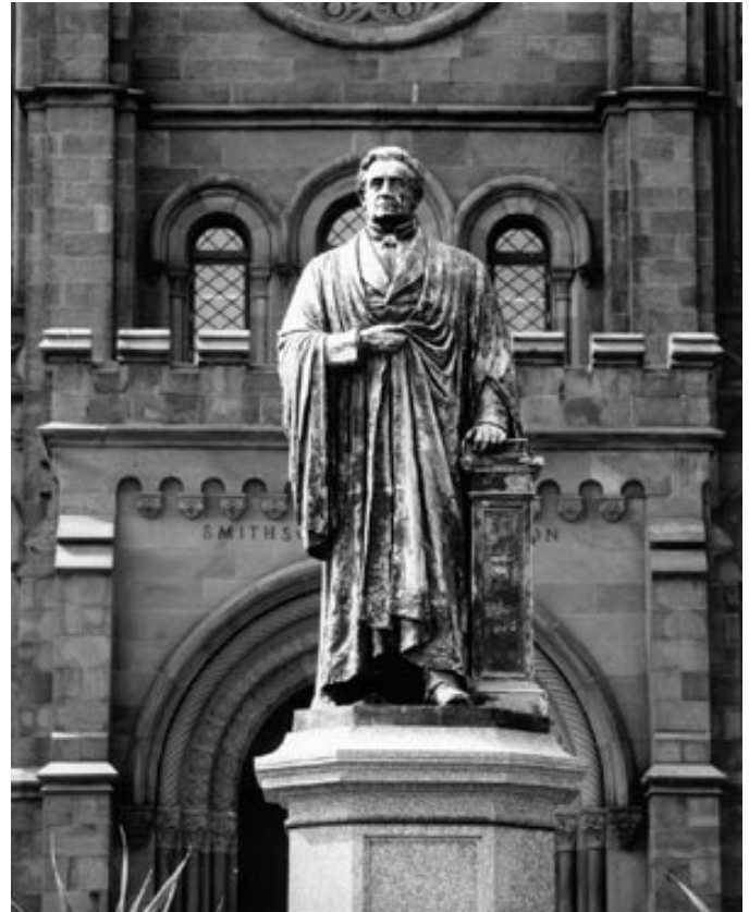
Joseph Henry's statue stands at the entrance to the Smithsonian Castle.