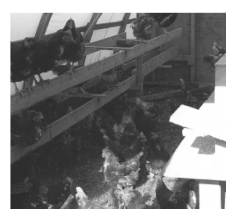
Inside view of free range poultry shelter.

<u>Commercial Brown Layer</u> – Each breeding company has its own strain. This is also a refined bird requiring a high quality diet. It may produce a little less than the white layer, and is a larger bird (five pounds when mature). It tends to be cannibalistic if stressed. Five to ten percent of brown layers will produce fishy smelling eggs if fed fishmeal or canola meal.