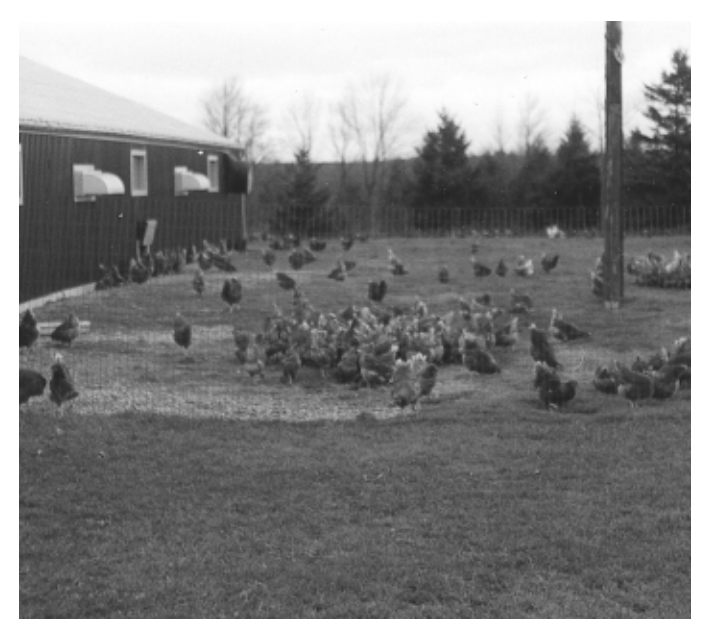
Organic free range poultry.

<u>Conventional Layers (battery cages)</u> – In this system two to four pullets as young as 19 weeks of age are put into a wire cage with an area of approximately two square feet. A barn full of these cages is known as a battery of cages.