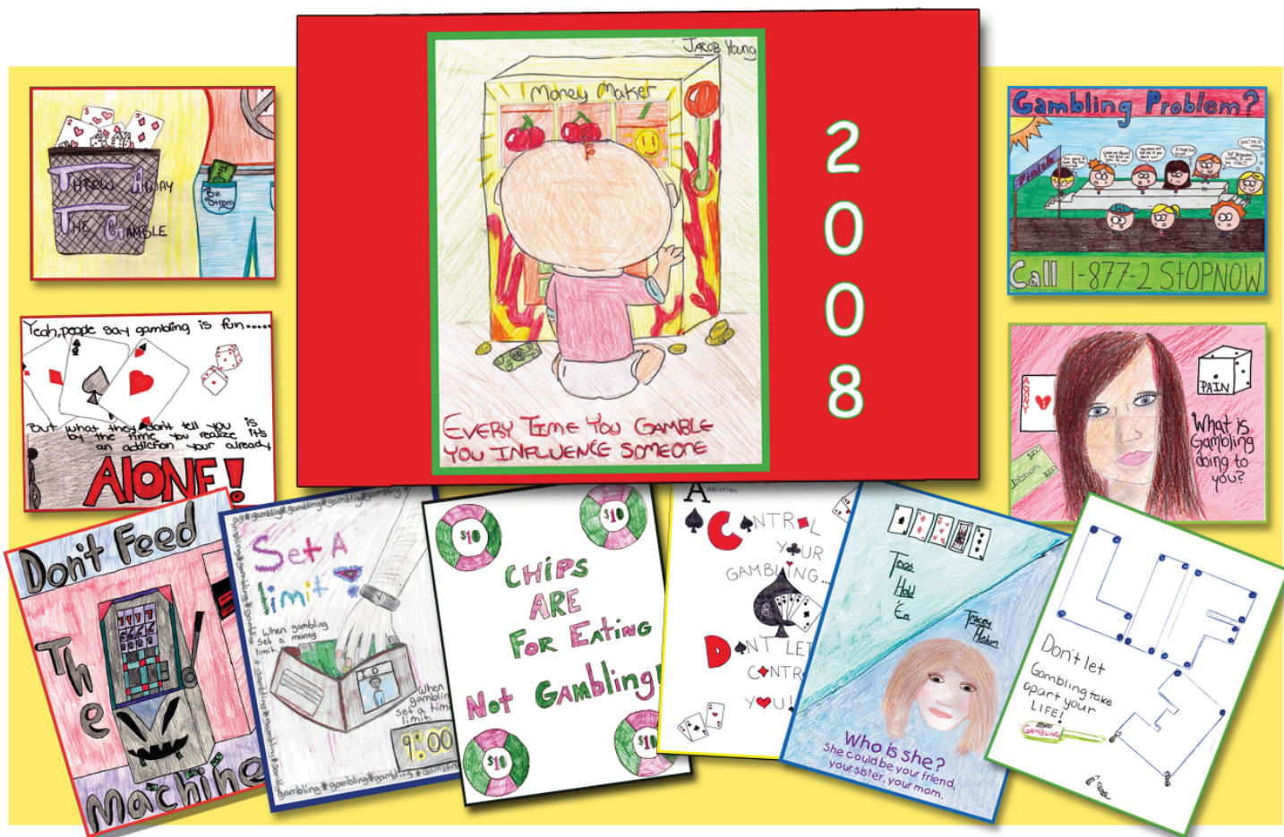
Samples of previous artwork

The top 12 submissions will be included in a Special 2009 calendar that will be distributed throughout the State.