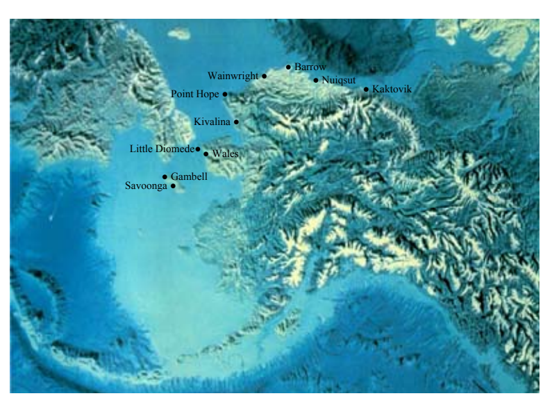
Bowhead Whaling Villages of Alaska