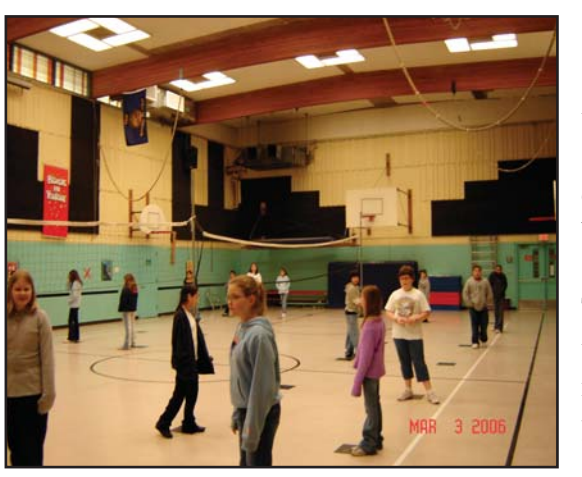
The gym at Sunset Height Elementary is much brighter now that energy-efficient lighting has been installed.