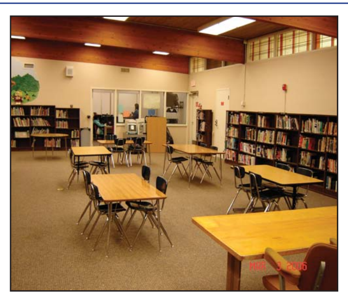
AFTER: The library at Sunset Elementary School after the new lighting was installed is brighter and and evenly distributed. The schools expects to save 47 percent of its energy use.