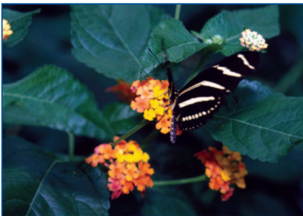
Figure 5 —As caterpillars, nonnative butterflies can be very destructive to native plants by feeding on leaves that are necessary for plant health.

A. USDA–APHIS requires permits under the authority of the Plant Protection Act of 2000. Import permits are required for regulated articles that pose a risk of introducing exotic plant pests and diseases into the United States. Interstate movement of plant pests, including arthropods, mollusks, plant pathogens, vectors, noxious weeds, nematodes, and items that may harbor these organisms, also requires a PPQ permit.