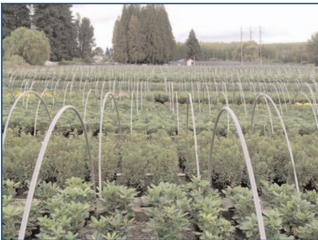
Figure 3 —Nurseries can be a pathway for the spread of the deadly plant pathogen Phytophthora ramorum .

A. Any natural enemy, predator, or parasite used to control other living organisms.