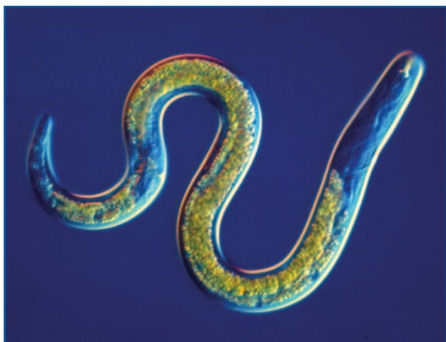
Figure 7 —Nematodes are microscopic organisms that generally feed on the roots of various plants, causing a considerable reduction in crop yields.