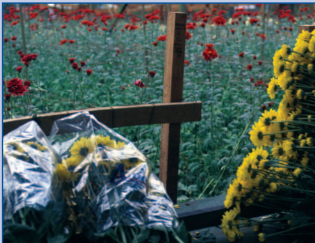
Figure 1 —Chrysanthemum white rust is one of the many plant diseases and pests that could accompany shipments of plants and cut flowers into the United States.

In today's global marketplace, the volume of international trade brings increased potential for the introduction of foreign pests and diseases that could threaten the safety of American agriculture. The results of such introductions can have a devastating effect on the U.S. food supply, damage our natural resources, and cost hundreds of millions of dollars in eradication and control measures that ultimately result in higher priced agricultural products for the consumer.