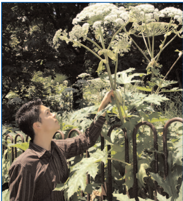
Figure 4 —Giant hogweed, a Federal noxious weed, produces a watery sap that if exposed to human skin can cause painful blistering and scarring.