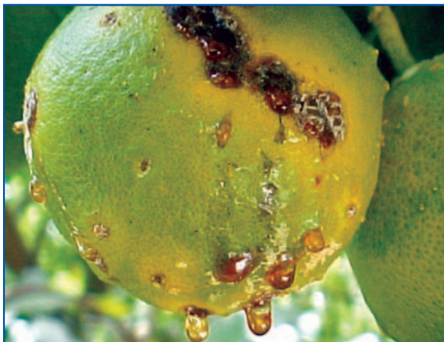
Figure 6 —Originating from Asia, a bacterial disease known as citrus canker can destroy entire crops by severely blemishing fruit, defoliation, dieback, and premature fruit drop.

Authorization to move live plant pests may be obtained by permit. PPQ carefully weighs the risks against expected benefits in making decisions to issue permits to move live plants, plant pests, noxious weeds, and biological control organisms.