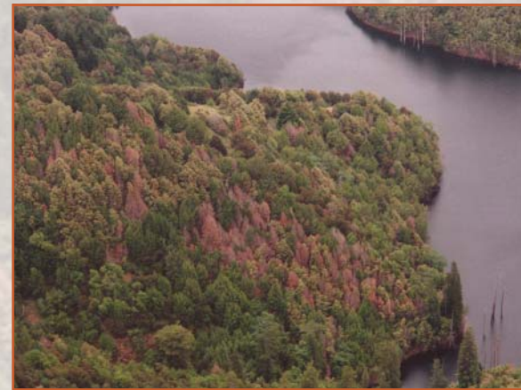
Figure 1—This aerial view shows tree death in Kent Lake, CA, woodlands infested with the sudden oak death pathogen, Phytophthora ramorum .

In 1995, a mysterious and sometimes lethal plant pathogen was detected for the first time in the woodland environment of Marin County, CA. Over the next several years, foresters, conservationists, plant pathologists, and the general public noticed that trees were dying in large numbers in coastal northern California. Initially observed in a limited number of oak species, the organism infected and eventually killed thousands of tanoaks, as well as coast live oaks, California black oaks, canyon live