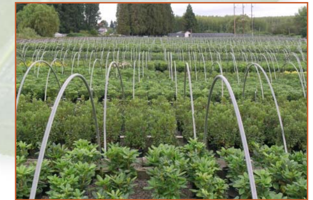
Figure 5—Nurseries can be a pathway for the spread of P. ramorum .

During spring 2004, the California Department of Food and Agriculture confirmed the presence of P. ramorum , the sudden oak death pathogen, on several varieties of camellia plants at two large California wholesale production nurseries. Investigation of shipping records revealed that these facilities had shipped large quantities of several varieties of common household garden plants nationwide.