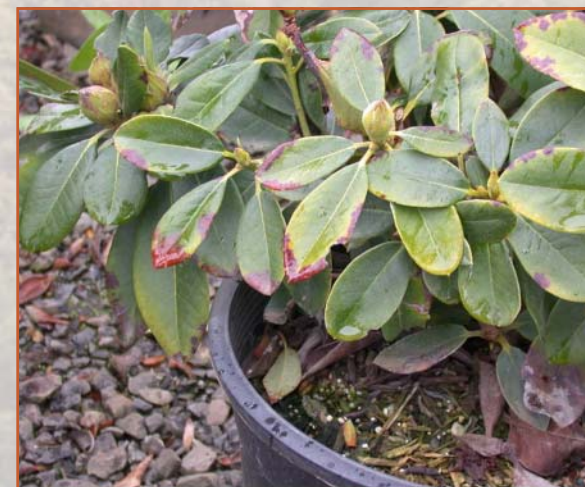
Figure 3—Rhododendron, a common nursery plant, is one of more than 70 plant species and cultivars susceptible to P. ramorum .

P. ramorum has a broad range of hosts, including hardwoods (e.g., coast live oak), softwoods (e.g., coast redwood), landscape plants (e.g., camellia and rhododendron), and herbaceous plants (e.g., western starflower). To date, more than 75 plant species and cultivars representing more than 45 genera can either be infected by P. ramorum or facilitate its spread.