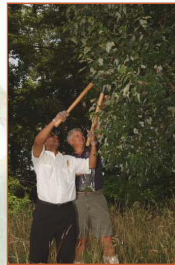
Figure 8—Agricultural officials survey for the pathogen in areas surrounding nurseries. Here, leaf and branch samples are collected from a maple tree.

Although quarantines are in place in 14 northern California counties and 1 county in Oregon (where the pathogen exists in the environment), eradication