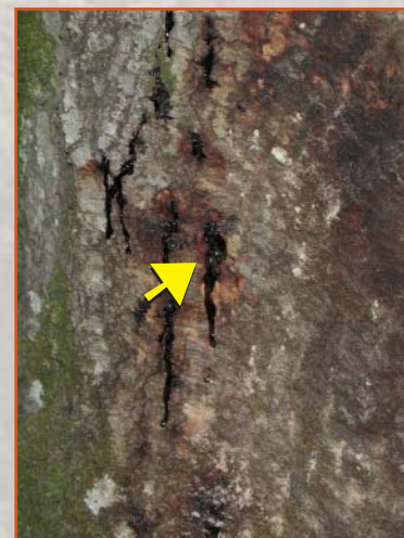
Figure 2—The trunk of this P. ramorum -infected coast live oak exhibits the bleeding cankers associated with sudden oak death.

oaks, and Shreve oaks. The pathogen also infected, but did not kill, a number of other plants.