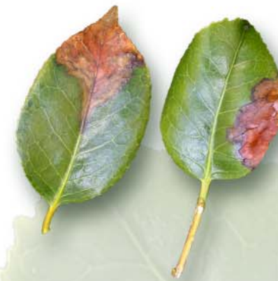
Figure 4—These camellia leaves show P. ramorum -induced leaf spot.

To learn more about other plants susceptible to P. ramorum , please visit the APHIS Web site at: < http://www.aphis.usda.gov/ppq/ispm/pramorom >.