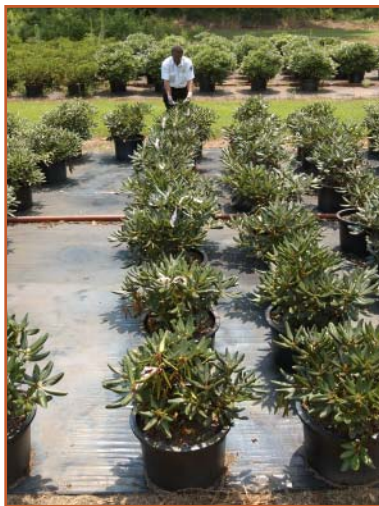
Figure 7—An APHIS plant health safeguarding specialist flags sampled rhododendrons for destruction should they prove positive for P. ramorum .

By the end of 2004, west coast nurseries had shipped more than 2.3 million exposed or "at-risk" plants to every State except Hawaii. Inspectors found infected plants at 171 nurseries in 21 States. Early in December 2004, APHIS began restricting the movement of nursery stock from California, Oregon, and Washington. At the time these restrictions were established, these three States appeared to present the greatest risk of moving P. ramorum in nursery stock shipments.