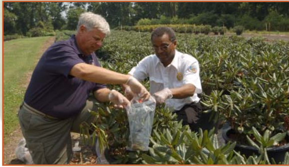
Figure 6—Employees from the Maryland Department of Agriculture's Plant Protection and Weed Management Division (left) and APHIS' Plant Protection and Quarantine program collect leaf samples from rhododendrons during a national survey for P. ramorum in nurseries.

most likely to experience P. ramorum damage and then expanded the agency's efforts to detect the pathogen in the areas of greatest risk.