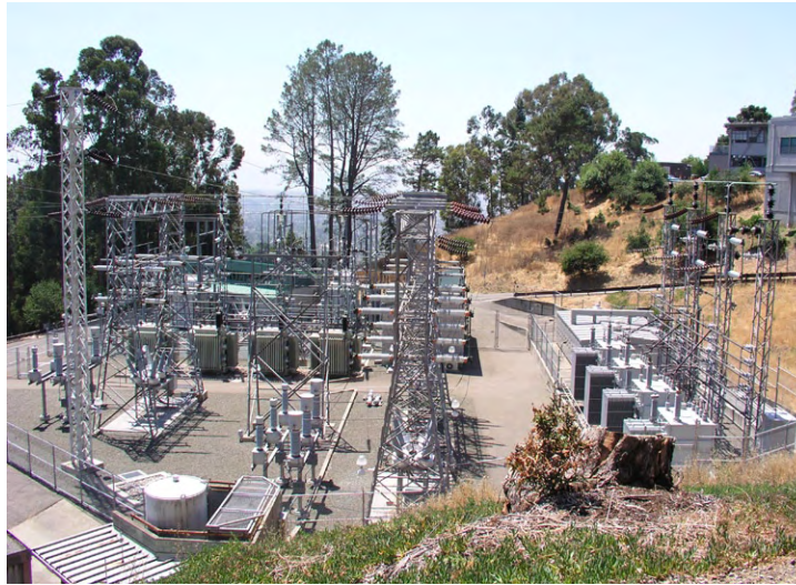
FIGURE 3.37 Grizzly Substation and UC Berkeley's Hill Area Substation each provide emergency backup for the other

equipped with pressure reducing stations and earthquake emergency shut-off valves.