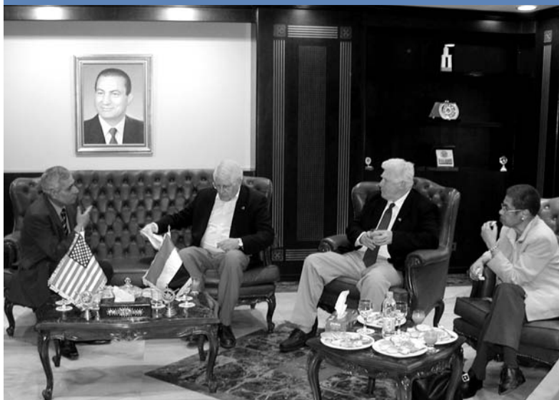
Congresswoman Norton in discussions with Egyptian Foreign Minister Ahmed Aboul Gheit (far left) during official visit to Egypt by six Members, that also included Israel, Jordan and Oman. Also pictured are second from left Rep. David Price (NC) and Rep. Jim Moran (VA).