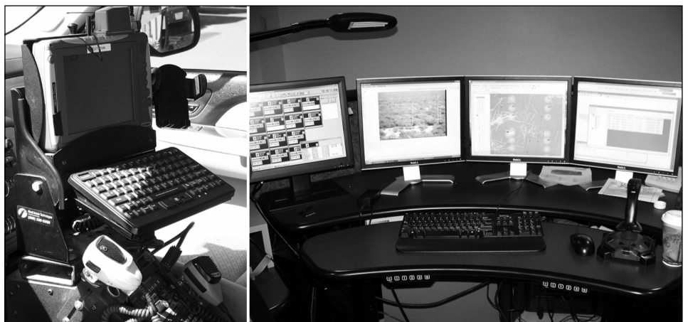
Figure 3: At Left, Mounted Laptop Installed in Border Patrol Vehicle; at Right, Project 28 Command and Control Center