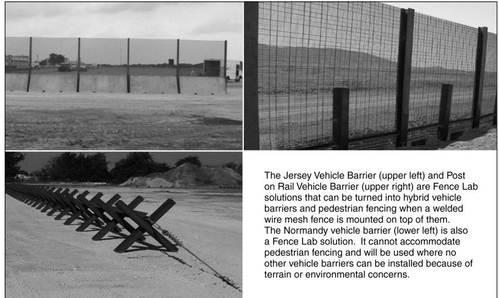
Figure 6: Vehicle Barriers and Fencing Developed by Fence Lab That Meet Performance Requirements and Are Included in SBInet’s “Toolbox” of Approved Fences and Barriers.

Source: GAO analysis of CBP data; photos by CBP.