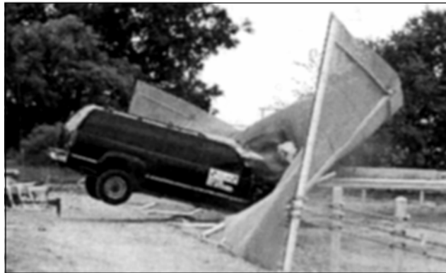
Figure 5: Fence Lab crash testing conducted in May 2007

criteria such as their ability to disable a vehicle traveling at 40 miles per hour (see fig. 5), allowing animals to migrate through them, and their cost-effectiveness. Based on the results from the lab, SBI net has developed three types of vehicle barriers and one pedestrian fence that meet CBP operational requirements (see fig. 6). The pedestrian fence can be installed onto two of these vehicle barriers to create a hybrid pedestrian fence and vehicle barrier. CBP plans to include these solutions in a “toolkit” of approved fences and barriers, 21 and plans to deploy solutions from this toolkit for all remaining vehicle barriers and for 202 of 225 miles of remaining fencing. Further, CBP officials anticipate that deploying these solutions will reduce costs because cost-effectiveness was a criterion for their inclusion in the toolkit. SBI net officials also told us that widely deploying a select set of vehicle barriers and fences will lower costs through enabling it to make bulk purchases of construction and maintenance materials.