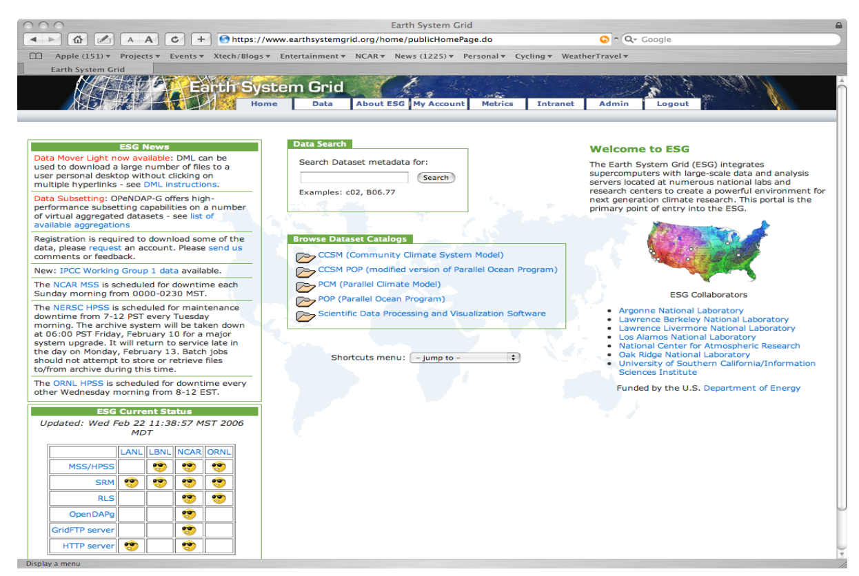
Figure 1: ESG portal, showing search form, ESG status (lower left) [7], recent news, etc.

scientists, have provided valuable input as we extend and improve ESG to meet the growing needs of the community. This feedback has been invaluable as we design and implement the next generation of ESG, both in terms of user interface and functionality.