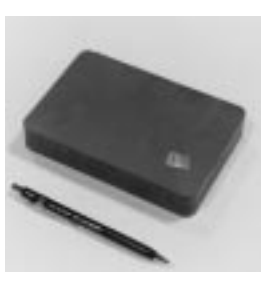
Bricks of magnetized strontium ferrite, stacked inside permanent magnets in the 8-GeV Line and Recycler, create the magnetic field.