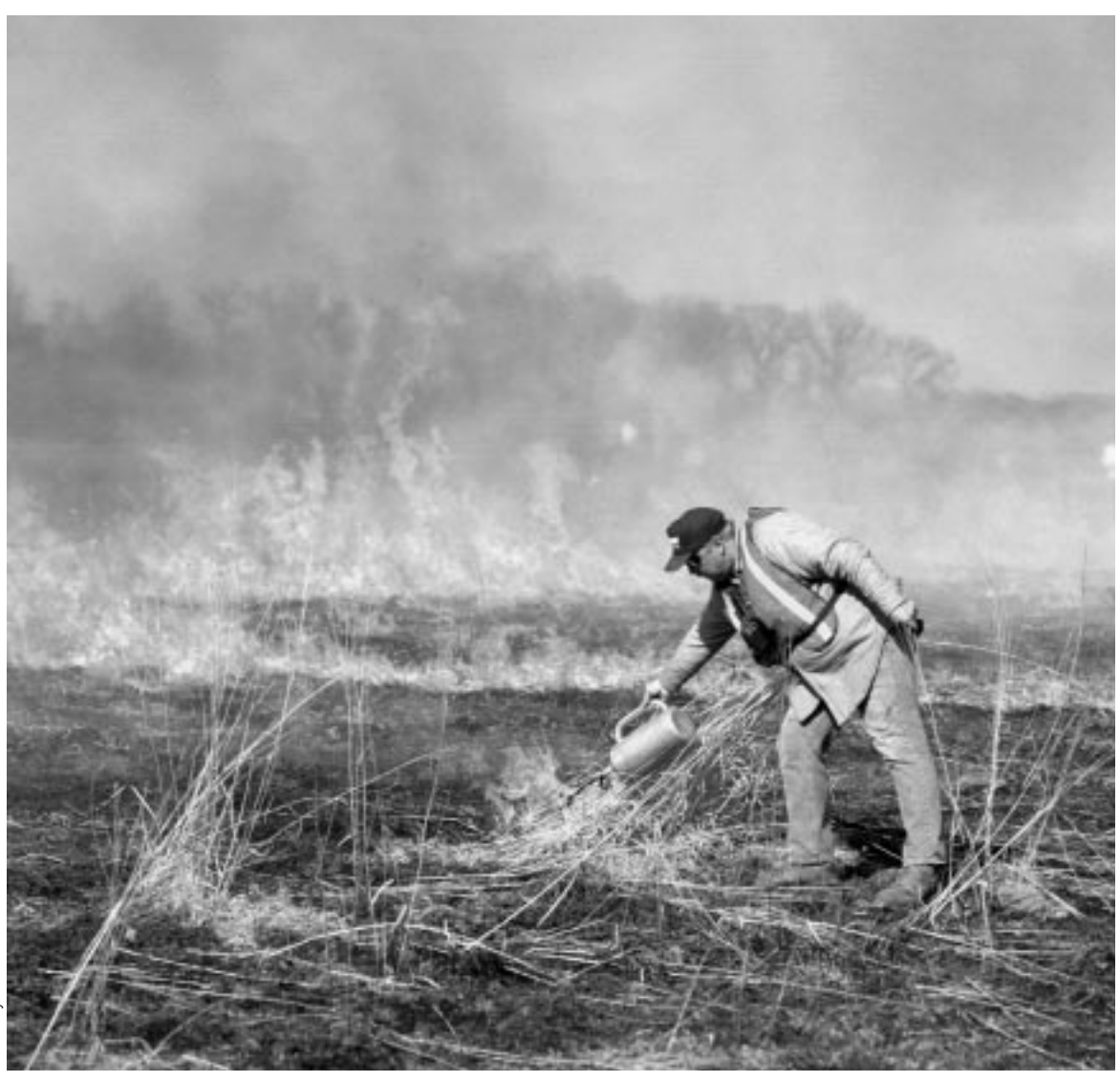
Bob Lootens of Roads and Grounds uses a drip torch to ignite a backfire.

On the day of the burn, the fire is set along a strip at the edge of the fire break on the downwind side of the area, with an igniting tool called a "drip torch" that drips a mixture of gasoline and diesel fuel from its nozzle. The fire will creep back into the wind. The perimeter fire break, wet down and offering no fuel, acts as a control against movement in the other direction. Fire is then set on the upwind side of the area; the strategy is aimed at having the flames meet somewhere in the middle, with nothing left to burn and nowhere left to go.