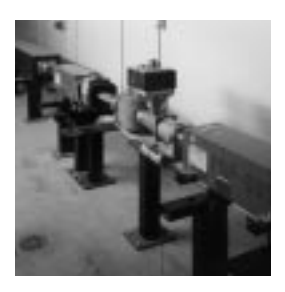
Permanent magnets flank beam monitoring instruments, a vacuum pump and a short "trim" electromagnet for course correction in the 8-GeV Line.