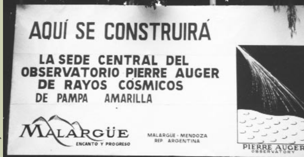
"ENCANTO Y PROGRESO" ("Enchantment and Progress") is the credo of the city of Malargüe, noted on the sign marking the construction site.

So scientists theorize that the particles must come from a relatively close source (within 50 to 100 megaparsecs), which wouldn't allow the time or space to interact with the cosmic background. Yet no observations anywhere