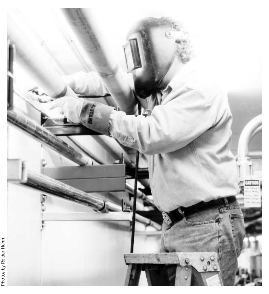
Under contract, workers repaired 4,000 welds in the LCW system.

Purchases for the Main Injector included every item inside the tunnel, from magnets to clamps, water systems to light bulbs.