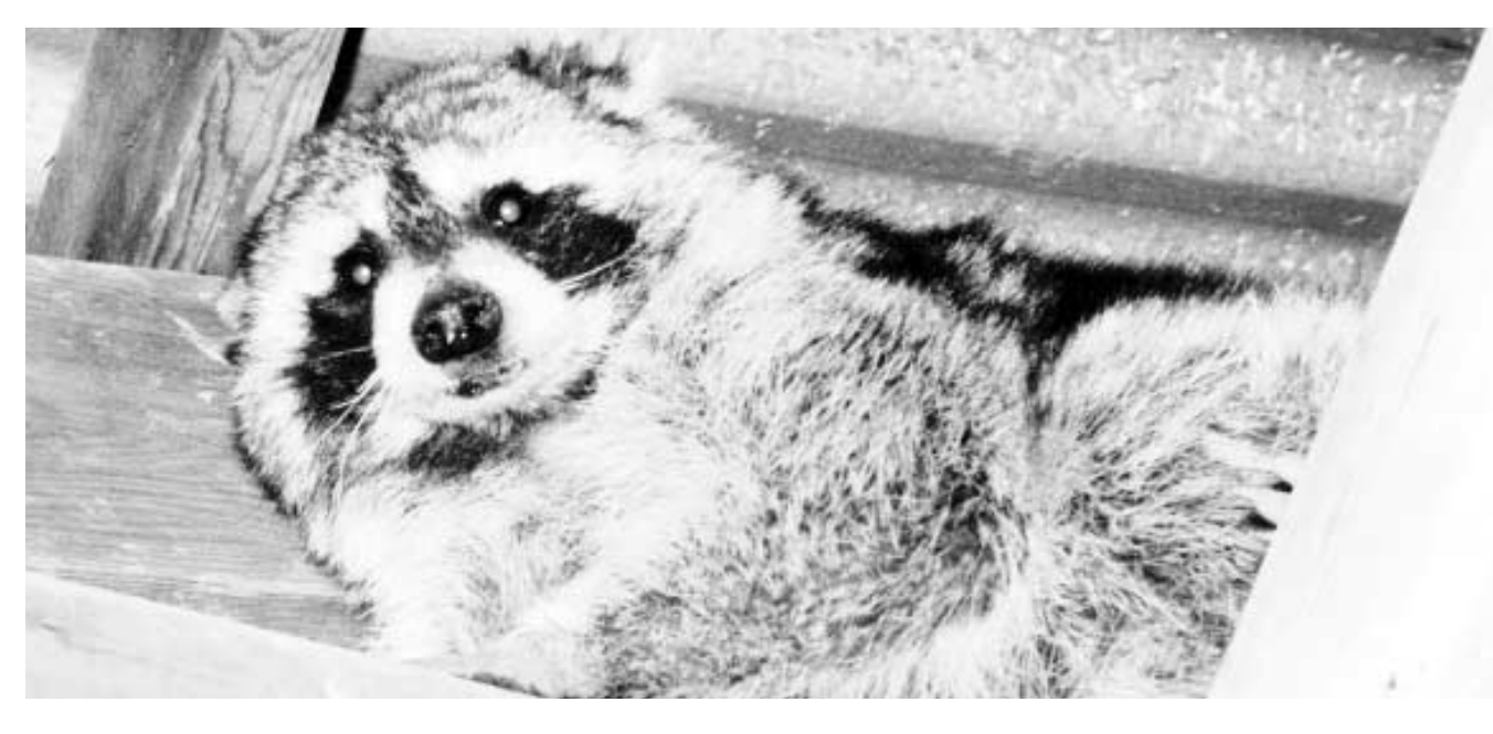
A raccoon in a storage building on the Fermilab site.