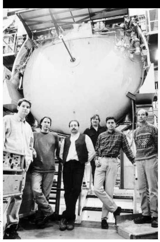
Part of the DZero team from MSU pose with their detector.

The members of the MSU high-energy physe