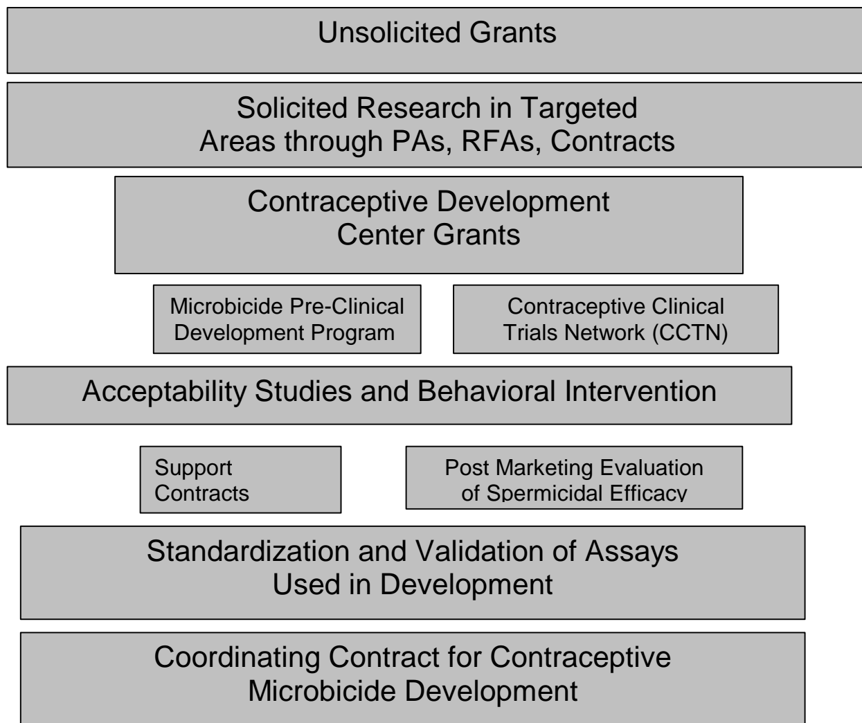
Figure 1: NICHD Contraceptive Microbicide Research and Development Program