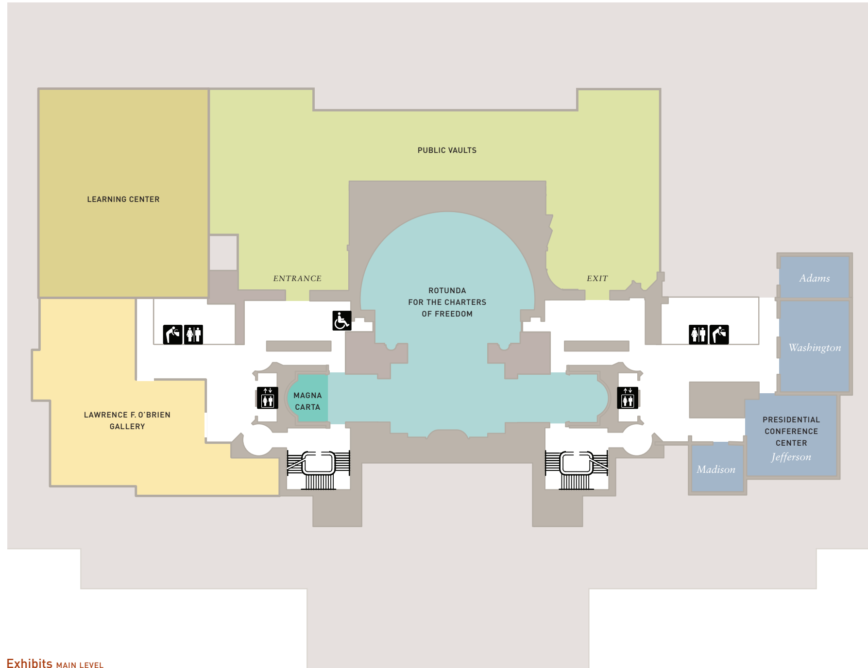
Exhibits MAIN LEVEL