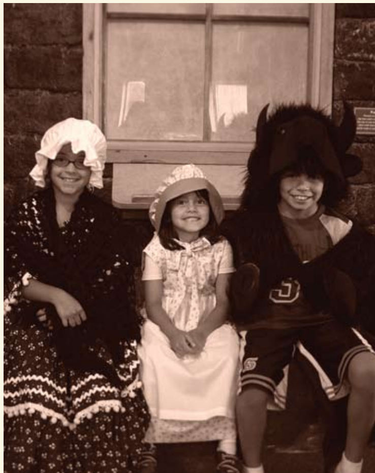
Children dress in period costumes while visiting the Prairie Wetlands Learning Center at the Fergus Falls Wetland Management District in Minnesota, which boasts a theatre that resembles a 19th century sod house.