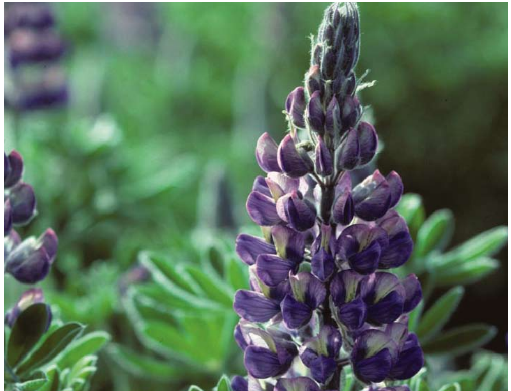
Lupine thrives at Rocky Flats National Wildlife Refuge in Colorado, which won the Outstanding Plan Award for its Comprehensive Conservation Plan. The annual awards recognize exceptional contributions to the Refuge System's planning program.

The 2006 refuge planning awards, presented annually by the Refuge System Division of Conservation Planning & Policy, recognize exceptional contributions to the Refuge System's planning program, just as the Refuge System invigorates its Comprehensive Conservation Planning process to meet Congress' 2012 completion deadline. The Refuge System developed its refuge planning awards and criteria in 2004.