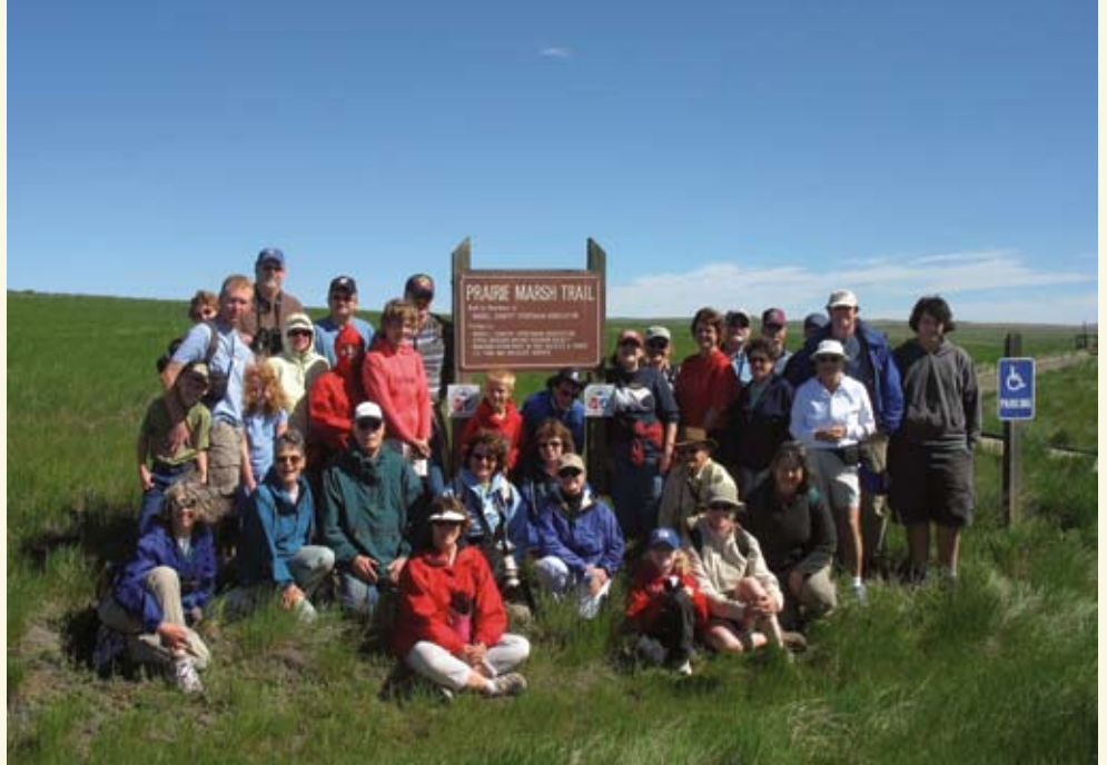
Benton Lake National Wildlife Refuge in Montana is a key partner in the Cascade County Physical Fitness Council, which has created the “Get Fit Great Falls” campaign. Complete with its own Web site, the campaign includes opportunities for all types of hikes, including guided prairie walks in the summer and snowshoe hikes in the winter.