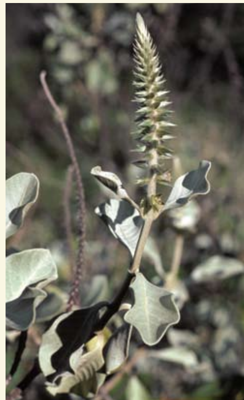
Nearly half of the 37-acre Kalaeloa of Pearl Harbor National Wildlife Refuge on the island of Oahu has been cleared of invasive weeds and replenished with native Hawaiian flora like this Ewa Hinahina, thanks to the efforts of the Naval Air Station Barber Point and volunteers organized by Leeward Community College.

The story begins in 1997, when an unusually wet winter enhanced the invasive's spread and threatened to