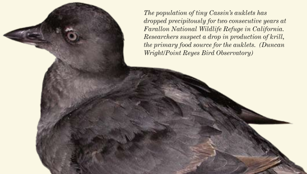
The population of tiny Cassin's auklets has dropped precipitously for two consecutive years at Farallon National Wildlife Refuge in California. Researchers suspect a drop in production of krill, the primary food source for the auklets.