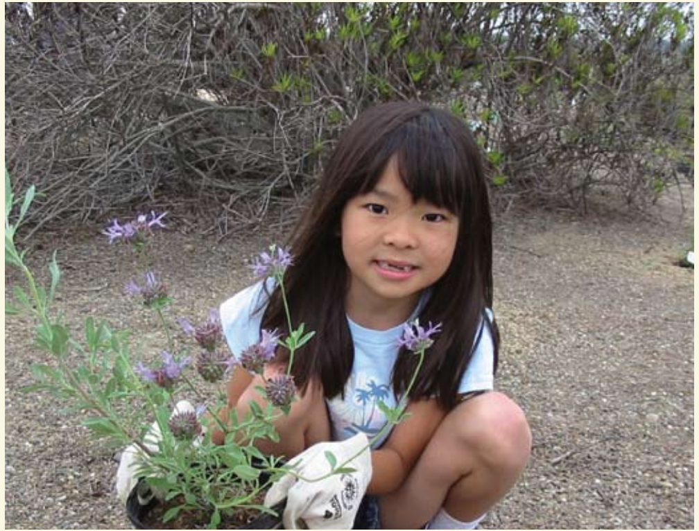
Volunteers of all ages are helping to restore Hog Island on Seal Beach National Wildlife Refuge in California, removing invasives and covering the island with native vegetation to provide nesting cover for the endangered clapper rail. (Bob Schallmann, U.S. Navy)

Great blue herons, peregrine falcons and other raptors prey on clapper rails, especially during exceptionally high tides when there is no place for the rails to hide. Wooden platforms were placed around the refuge, including