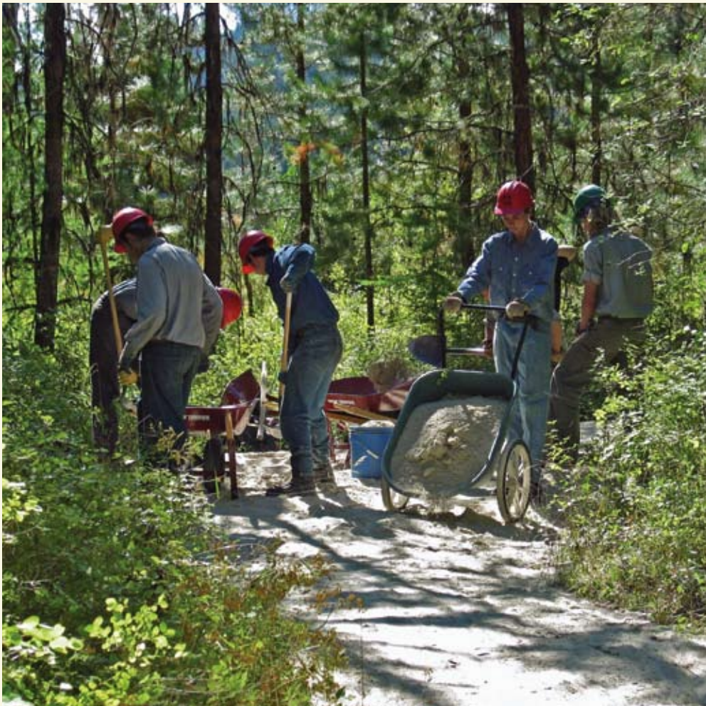
Little Pend Orielle National Wildlife Refuge in Washington hosted 110 Corps members over a 10-week period last summer. They thinned trees along the refuge boundary, built fencing, and helped open 2.5 miles of access road that had been overgrown for more than 15 years. (Lisa Langelier/USFWS)

T he very first Civilian Conservation Corps members planted 3 billion trees from 1933 to 1942. More than half a century later, the young successors to the CCC are still planting trees, many of them are on national wildlife refuges.