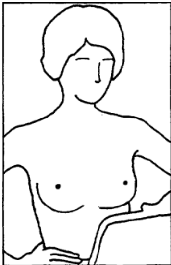
In Front of a Mirror