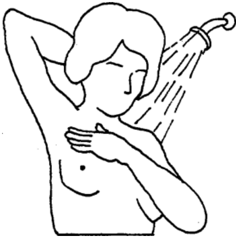
In The Shower