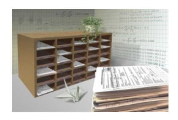
NSF funds about 11,000 new grant proposals year based upon reviewer recommendations. One challenge is to assign each grant application to the appropriate reviewers while ensuring that no one reviewer is overworked or has a potential conflict of interest.

Chemical engineers at Princeton University did not set out to invent a computer program to transform the way day-to-day work assignments are handled across government and industry. But this is precisely what happened while they were determining the best way for NSF to assign grant proposals efficiently and fairly to its many external reviewers.