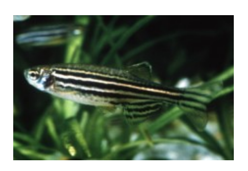
Researchers at Pennsylvania University discovered that a gene controlling pigmentation in zebrafish also plays a role in human skin coloration.

This and other work suggested to the team that the golden-like gene could be involved in human coloration. And in fact, a specific tiny variation in this human gene was prevalent in individuals from lighter-skinned European populations, while the gene without the change was common among West Africans and East Asians with darker pigmentation. For more on this story, see NSF's "A Fish of a Different Color" press release.