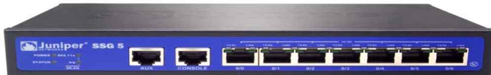
Figure 1: Front of the SSG 5 device