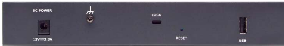
Figure 2: Rear of the SSG 5 device